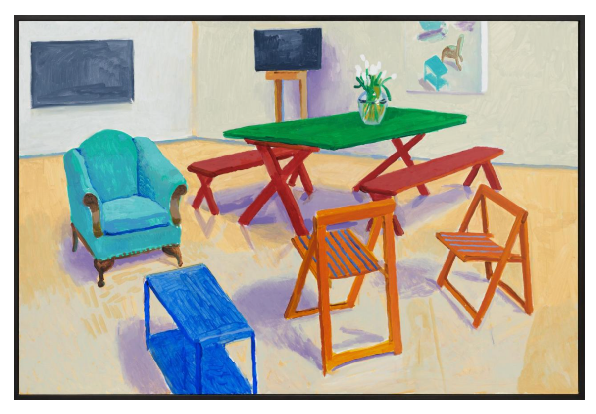
David Hockney, Studio Interior #2 (2014). © David Hockney.