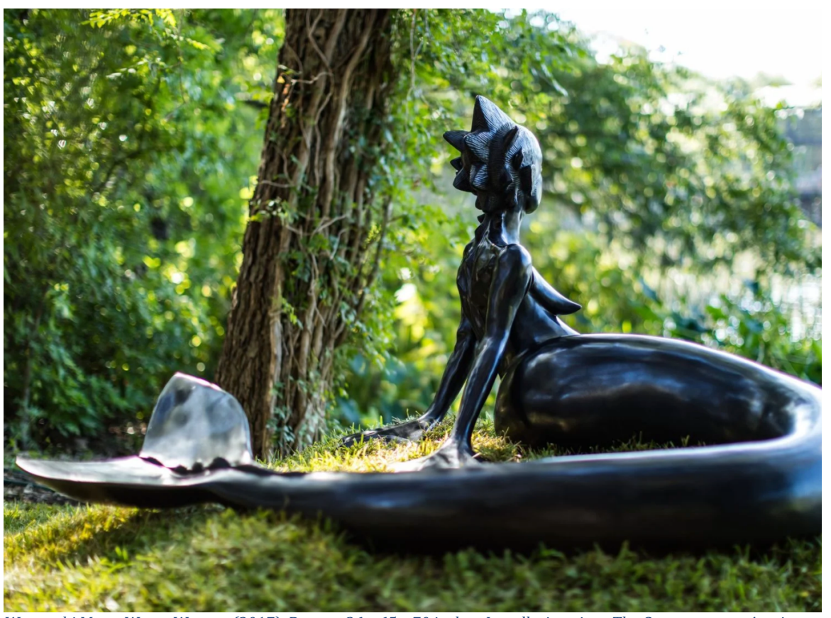
Wangechi Mutu, Water Woman (2017). Bronze, 36 \times 65 \times 70 inches. Installation view: The Contemporary Austin – Laguna Gloria, Austin, Texas, 2017. © WANGECHI MUTU. Courtesy the artist and Gladstone Gallery, New York and Brussels. Image courtesy The Contemporary Austin. Photo by Brian Fitzsimmons.

Postponed a year due to Covid-19, New Orleans contemporary art triennial Prospect.5 is finally opening to audiences over three weekends from 23 October through 6 November. This staged approach was necessitated by Hurricane Ida, which caused significant damage when it hit Louisiana in late August. The event's opening weekend festivities, previously planned for 21–24 October, will now take place towards the end of its run in January 2022.