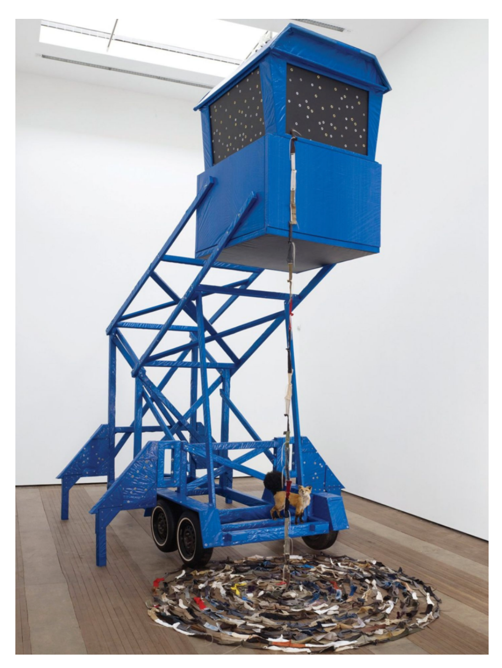
Figure 2Nari Ward, T.P. Reign Bow (2012). Wood, blue tarp, brass grommets, zippers, human hair, and taxidermy fox. 224 \times 156 \times 270 inches.

Battleground Beacon is a tower on a trailer, a form taken from portable police floodlights used to light up areas they deem 'dangerous'. Instead of light, however, the work is a giant megaphone that plays speeches from Martin Luther King Jr., Malcolm X, Amanda Gorman, and others.