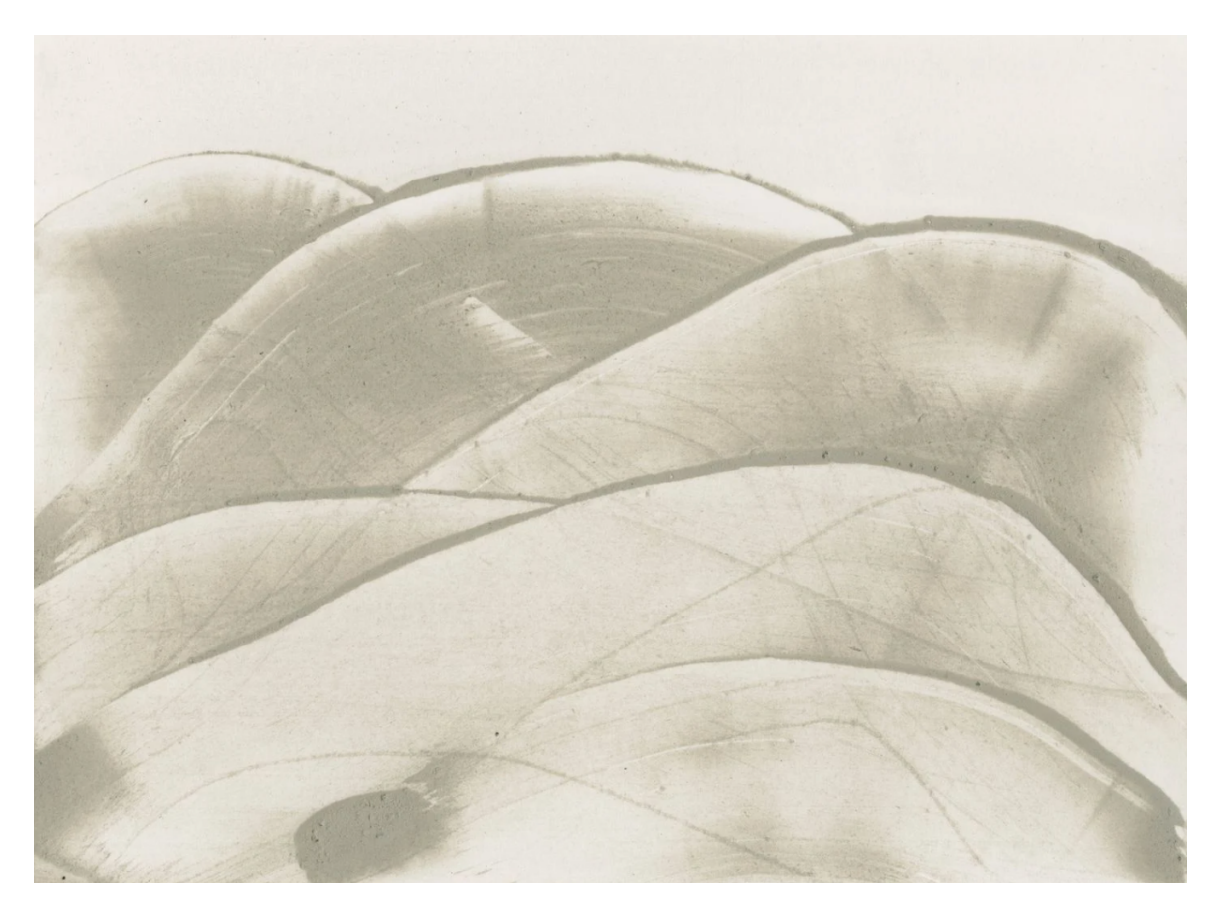
Dineo Seshee Bopape, still from clay drawing animation.

Johannesburg-based artist Dineo Seshee Bopape also looks to rivers as sites of historical violence in her animation made with over 900 drawings done with clay collected from the rivers of Richmond, Virginia; New Orleans, Louisiana; Capetown, South Africa; Senegal; and Ghana. The works explore the impact of the slave trade and colonialism on indigenous peoples.