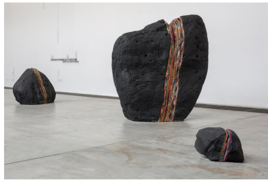
For Así comienza una montaña (2019), shown at the 2019 Venice Biennale, Cynthia Gutiérrez has embedded textiles in volcanic rocks.