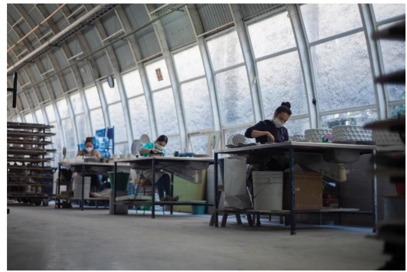
Guadalajara's Cerámica Suro is one of the world's most sought-after ateliers.