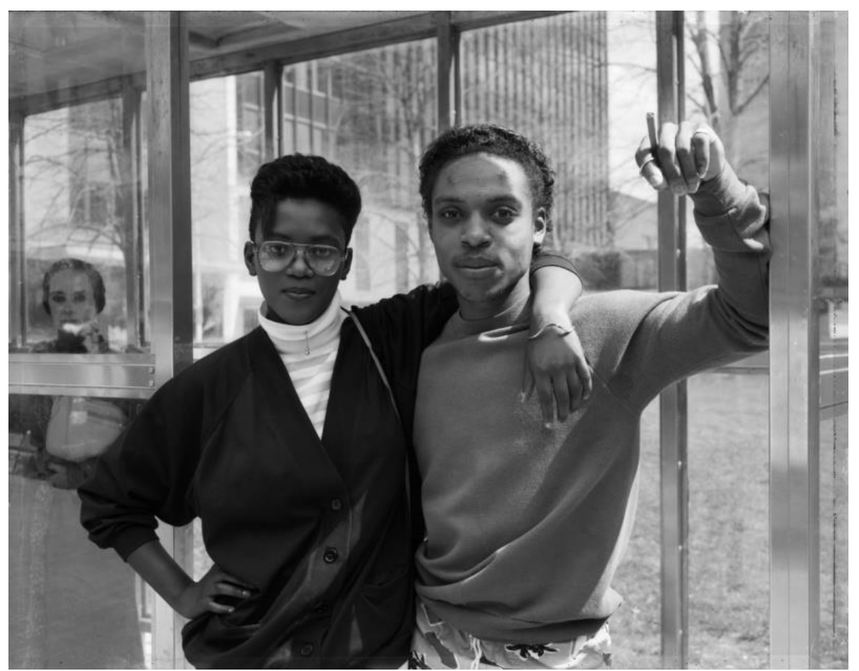
DAWOUD BEY, A COUPLE AT A MAIN STREET BUS STOP, ROCHESTER, NY, (1989) FROM STREET PORTRAITS (2021).

Soon before the opening of his retrospective "An American Project" at New York's Whitney Museum—the last stint of an exhibition tour that began at the San Francisco Museum of Art and passed through the High Museum of Art in Atlanta—I turned to Bey for answers regarding his ruminations on life and art.