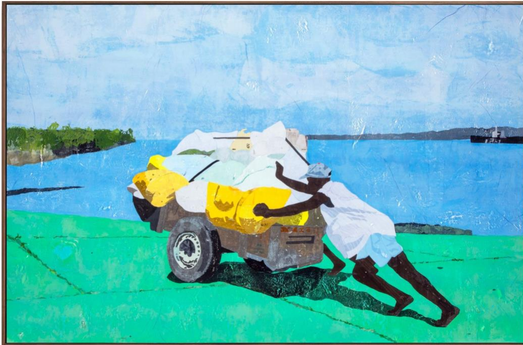
HUGO MCCLLOUD, "with all your might," 2020 (single use plastic mounted on panel, painting: 55 x 84 inches / 139.7 x 213.4 cm; framed: 56 1/2 x 85 1/2 x 2 1/8 inches / 143.5 x 217.2 x 5.4 cm). | © Hugo McCloud, Courtesy the artist and Sean Kelly Gallery

THE WORK OF Hugo McCloud has shifted profoundly over the past year. His latest paintings on view at Sean Kelly Gallery in New York, were produced using single-use plastic bags—plentiful, overlooked, non-biodegradable material available in a spectrum of colors. The plastic served as his "paint." The works are composed of hundreds, or maybe even thousands, of pieces cut out from the bags, layered and mounted on a panel, and fused into place using an iron. McCloud sourced the material from India, Africa, and directly from manufacturers.