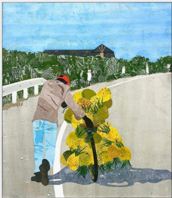
HUGO MCCLLOUD, “pineapple express,” 2020 (single use plastic mounted on panel, painting: 70 x 60 inches / 177.8 x 152.4 cm; framed: 71 1/2 x 61 1/2 x 2 1/8 inches / 181.6 x 156.2 x 5.4 cm). | © Hugo McCloud, Courtesy the artist and Sean Kelly Gallery

McCloud is known for working with scrap metal and tar paper. His previous solo show at the gallery was titled “ Metal Paintings ,” an apt description of the abstract works composed of bronze sheets with soldered, torched, and chemically patinated surfaces.