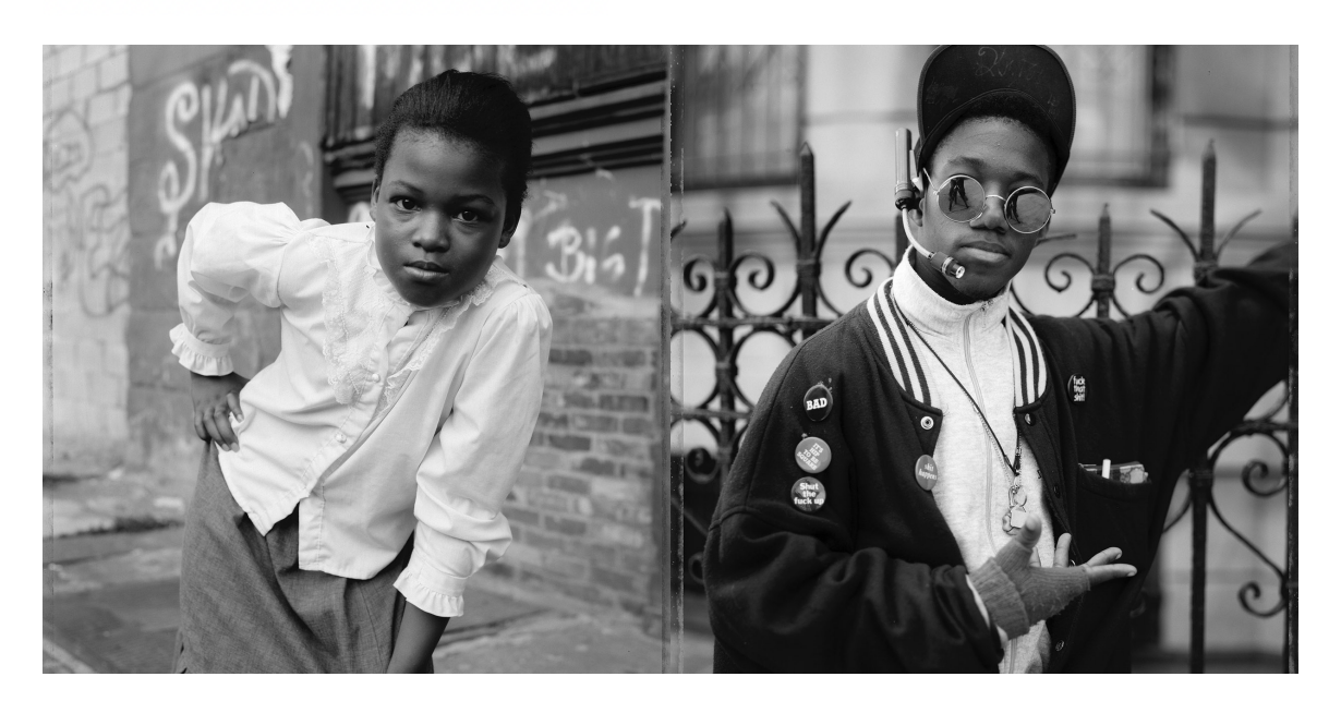
Left: A Young Girl Striking A Pose, Brooklyn, NY 1988 Right: A Young Man with Buttons, Brooklyn, NY 1988