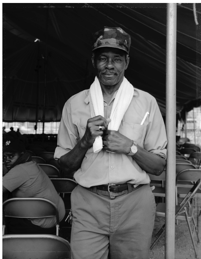
A Man with a Towel, Brooklyn, NY 1989

are not Black that I consider my work to be in conversation with, rather than someone whose training is strictly in race and representation theory, who knows little if anything about the deeper history of my work outside of that theory.