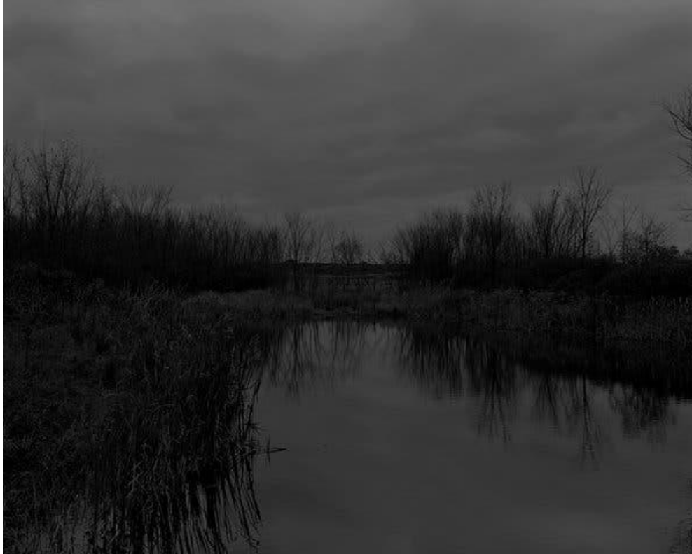
The marsh.