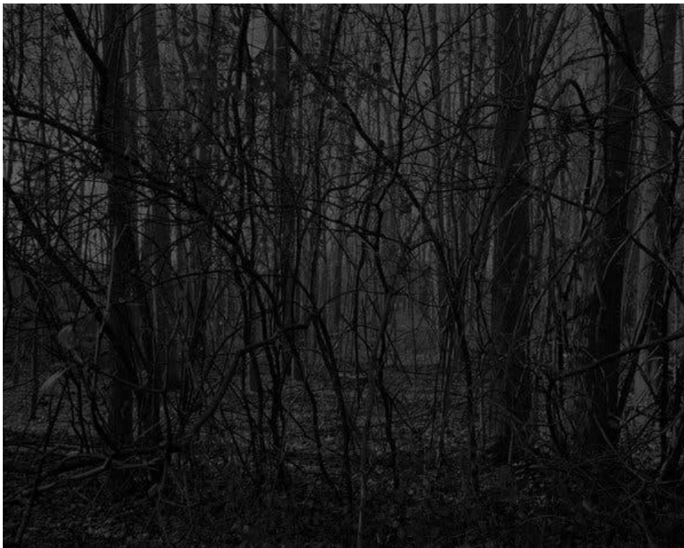
Forest with small trees.