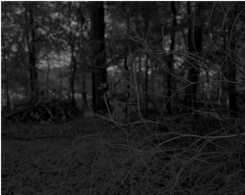
Branches and woods.