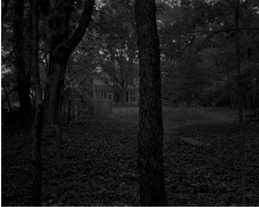
Trees and farmhouse.

Art (July 14 to Sept. 30), is site-specific. Installed in St. John's Episcopal Church, a stop on the Underground Railroad known as Station Hope, it summons a time in African-American history when the journey to freedom was made largely through the shadows of the night.