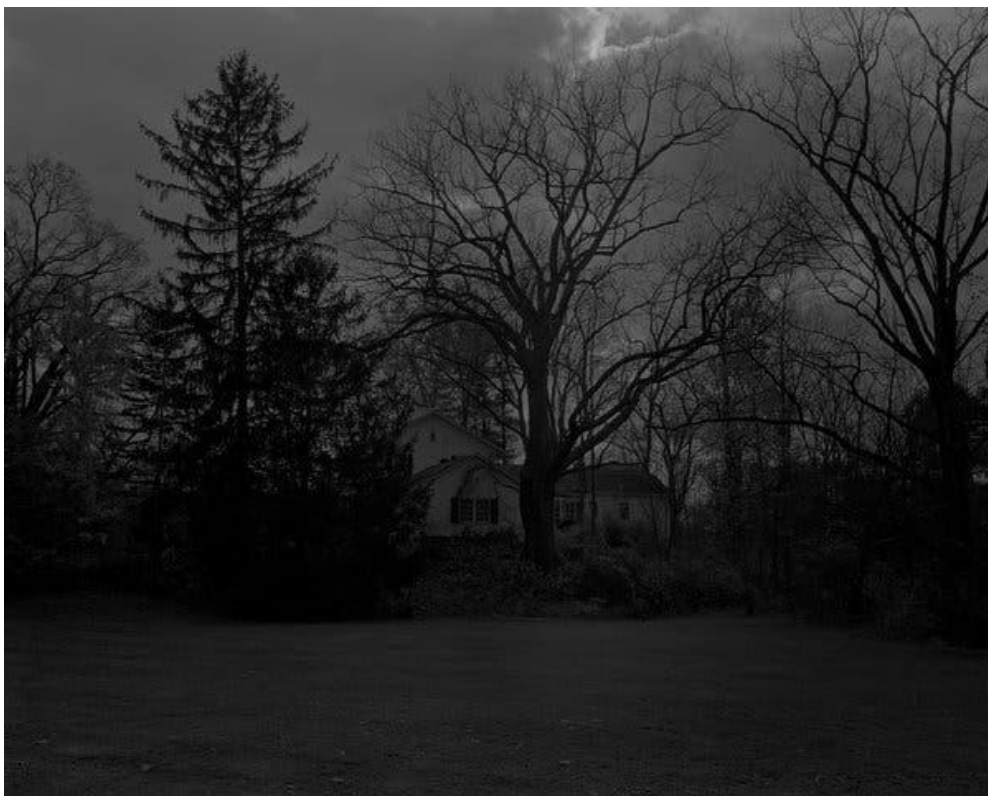
The site of John Brown's tannery.