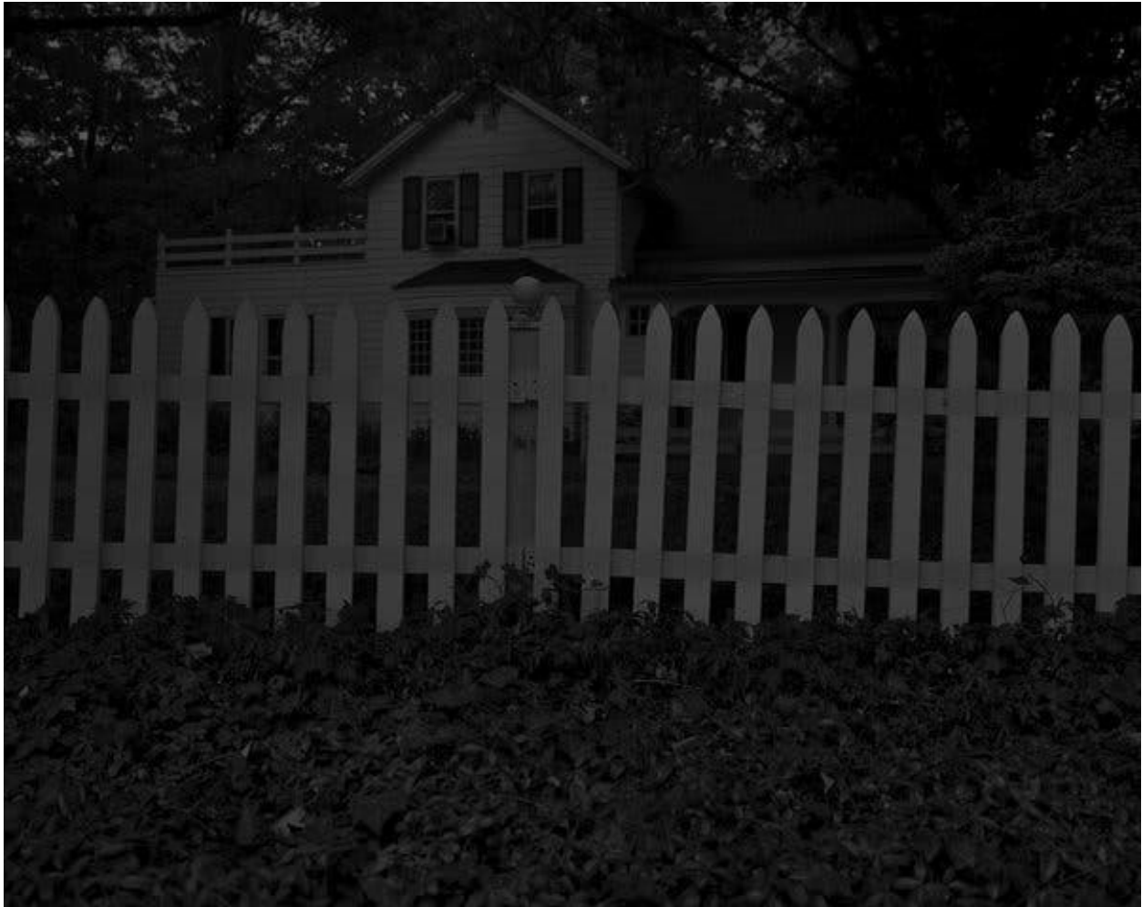
Picket fence and farmhouse.

In his poem "Dream Variations," published in 1926, Langston Hughes yearned for a time when the African-American worker, exhausted by the daily grind of hard labor and discrimination, might be truly free. This liberation, he imagined, would be achieved not in the glare of daylight, but rather under the brooding, protective cover of night. Inverting a dominant literary conceit, blackness and not whiteness functioned as a metaphor for hope and transcendence — a "Night coming tenderly/Black like me," as Mr. Hughes wrote, that abetted the struggle for racial equality and justice.