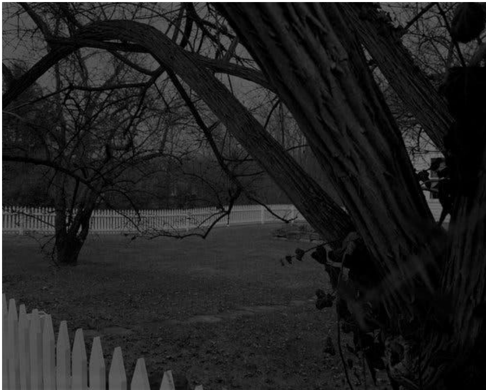
Farmhouse and picket fence.

Mr. Bey, who was named a MacArthur fellow last year, credits another important influence for “Night Coming Tenderly, Black”: Roy DeCarava. Mr. DeCarava, who died