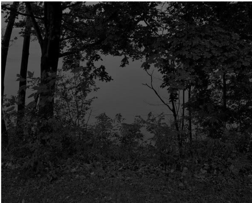
At Lake Erie.

"It is a tender one, through which one moves," he observes. "That is the space I imagined the fugitive black subjects moving through as they sought their own self-liberation, moving through the dark landscape of America and Ohio toward freedom under cover of a munificent and blessed blackness."