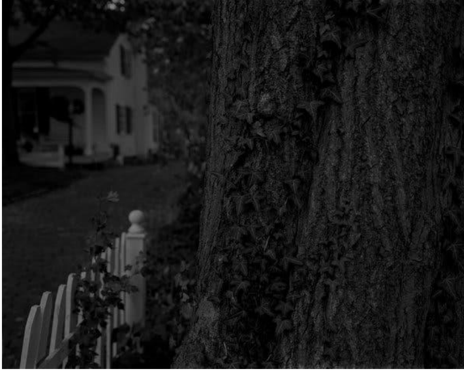
Tree trunk, picket fence and house.