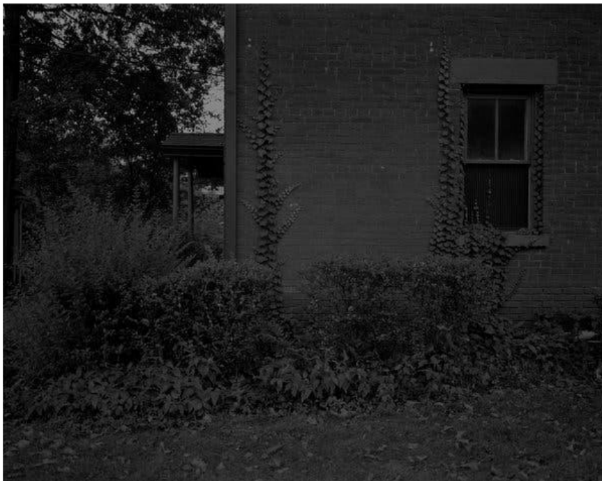
Cozad-Bates House. Dawoud Bey