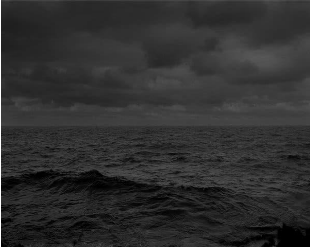
Lake Erie and sky.