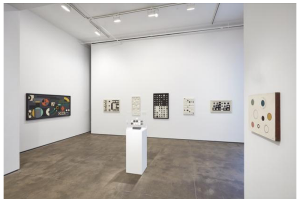
"Constructing Her Universe: Loló Soldevilla" exhibition view.

The Sean Kelly Gallery of New York (475 Tenth Avenue) exhibits until October 19 Constructing Her Universe: Loló Soldevilla, the first retrospective exhibition in the United States of the Cuban artist Dolores "Loló" Soldevilla (1901-1971). Considered as one of the pioneers of abstract art in Latin America, Soldevilla has been since the 50s one of the key figures for reading modern and contemporary Cuban art.