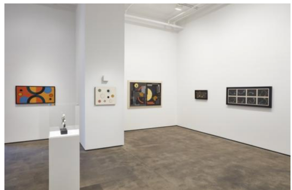
"Constructing Her Universe: Loló Soldevilla" exhibition view.

Back in Cuba, she founded the Color Luz Art Gallery with Pedro de Oraá. Since her return to the Caribbean island, Soldevilla stood out for being a link between contemporary Cuban art with the Latin American and European scene, and, of course, being one of the greatest promoters of abstraction in the country. Her role as curator was also a key to Cuban art scene: it was precisely she who organized the exhibition Painting Today: The Avant-Garde of the School of Paris at the Palace of Fine Arts in Havana, show that she exhibited the artwork of more than forty Kinetic and Op-art artists. Jean Arp, Sonia Delaunay and Jesús Rafael Soto among others. For all this and the presence of Loló Soldevilla's career in contemporary artas an artist, curator and manager, Constructing Her Universe: Loló Soldevilla at the Sean Kelly Gallery in New York is a must for anyone who wants to understand and delve into Cuban abstraction and Latin American twentieth century art.