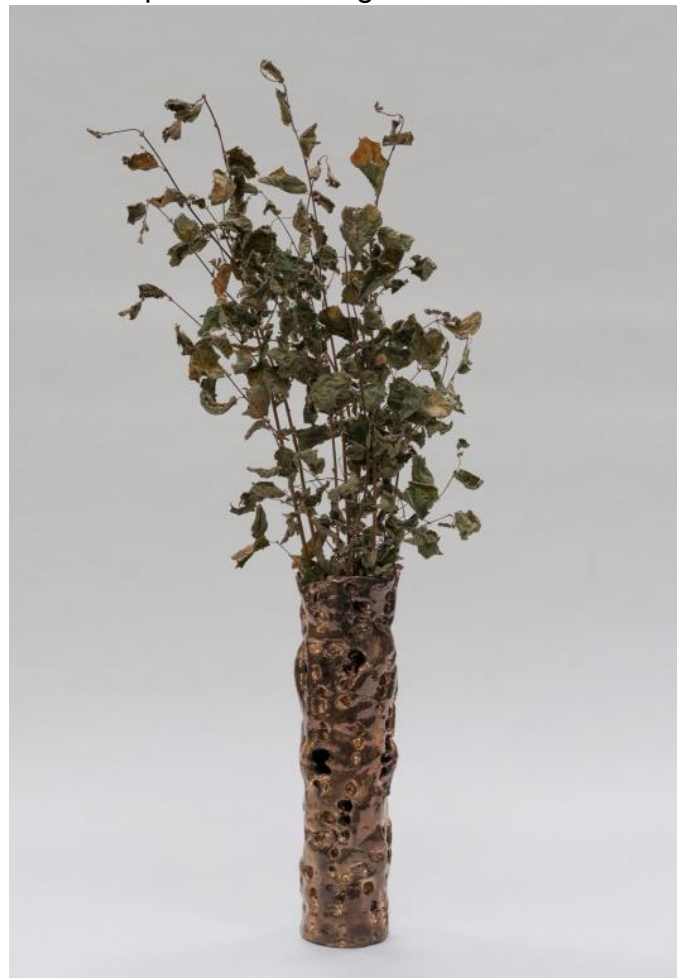
Markus Karstieß, Vernon Doe, 2010. Gold glazed ceramic, common hazel 24 5/8 x 7 1/2 x 7 1/8 in 62.5 x 19.1 x 18.1 cm

German artist Markus Karstieß works in ceramics and his many glazed works throughout the exhibition are a highlight of the show. Matching the aura and strength of the antiquities on view, his monumental piece, Nickel-Berg-Wesen (Fetisch), 2019, is ablaze with burnt sienna and turquoise blue, erupting like a fire atop a tall steel table. Another work, Howard Doe, 2009, is a huge sculptural vase, glazed to appear like burnished bronze with large holes gauged out of its sides, rendering it impossible to hold water. Sprouting from its opening is a clutch of Japanese fantail willow, an apt flower arrangement for such a impressive looking vessel.