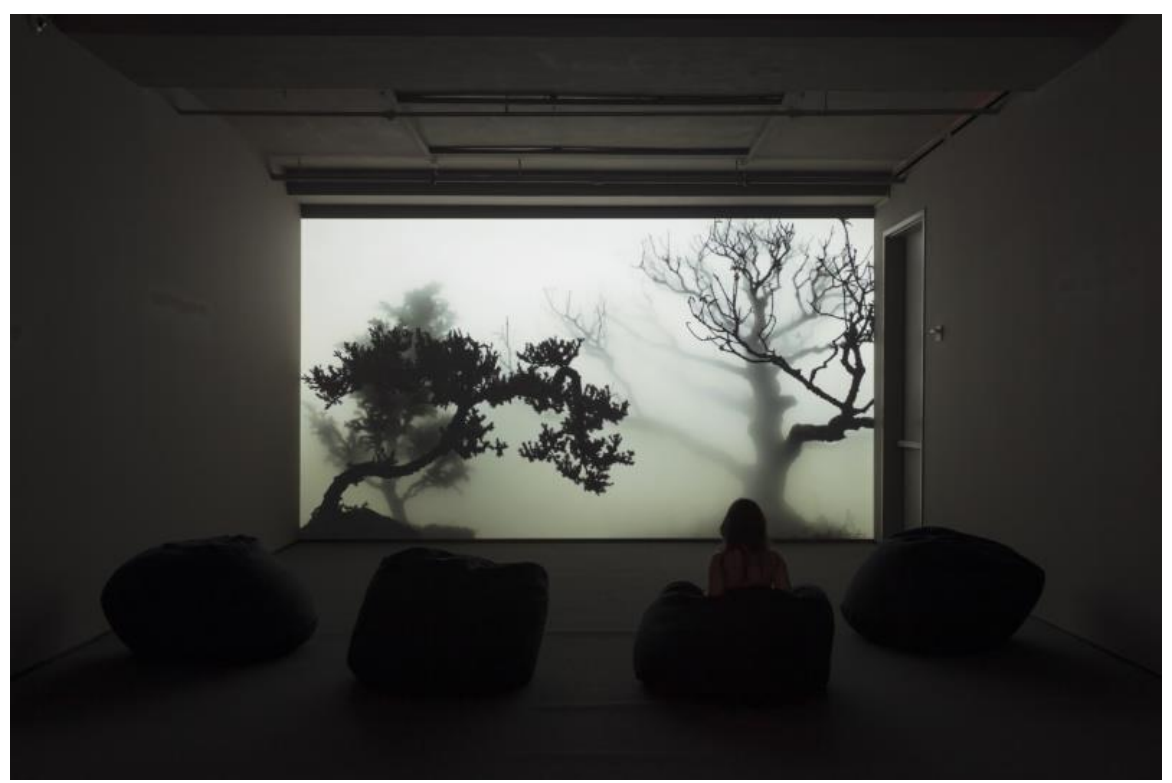
Installation view of Abstract by Nature at Sean Kelly, New York. June 28 – August 2, 2019.

This exhibition is the result of careful planning over many months, selecting artists that speak to each other across international boundaries and works that converse over the course of centuries. Sean Kelly Gallery, who represents Sun Xun and Liu Wei among other Asian artists in its roster, has recently opened a project space in Taipei, a move that will only deepen its connection to the East. But here, the gallery shows its immense sensitivity to cultural conversations, avoiding an easy East-West mishmash in favor of a richer exchange among unique, highly idiosyncratic artists. The result is a ravishing show that demonstrates a savvy approach to introduce new Asian artists to New York audiences with a methodology sure to spark greater curiosity.