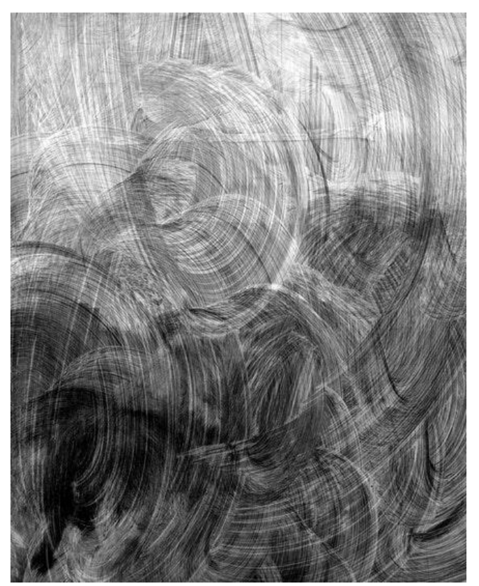
Idris Khan, White Windows; September 2016 - May 2018, 2019, digital fibre print, image: 50 3/16 x 40 3/16 inches (127.5 x 102.1 cm), paper: 57 5/16 x 47 5/16 inches (145.6 x 120.2 cm), framed: 61 7/16 x 48 7/16 x 2 3/4 inches (156.1 x 123 x 7 cm). Edition of 7 with 2 APs. © Idris Khan. Courtesy: Sean Kelly, New York

One of the real pleasures in viewing the ensemble of works is the sensitivity with which the artist modulates the monochromatic theme of the show with its achromatic tracery. A good example of this is The Calm is But a Wall (2019), a very large digital C print (71 × 113") in which a repeated score of musical notation is repeatedly over-printed in white. The repetition and overprinting make the score barely legible and certainly not viable for musical translation. The erasure of the score's time signature therefore needs to be read differently. The title suggests that Khan's version of a "wall of sound" is meant to express, paradoxically, the illusion of quietude and the impasse of measured intervals,