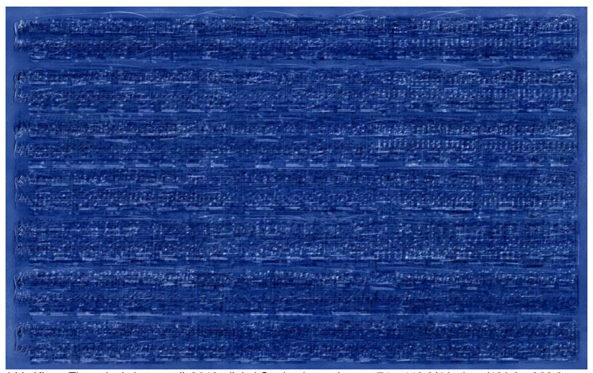
Idris Khan, The calm is but a wall, 2019, digital C print, image/paper: 71 x 113 3/4 inches (180.3 x 288.9 cm), framed: 78 1/2 x 121 1/4 x 2 3/4 inches (199.4 x 308 x 7 cm). Edition of 7 with 2 APs. © Idris Khan. Courtesy: Sean Kelly, New York

McGlynn, Tom. "Idris Khan: Blue Rhythms." The Brooklyn Rail. June 21, 2019.