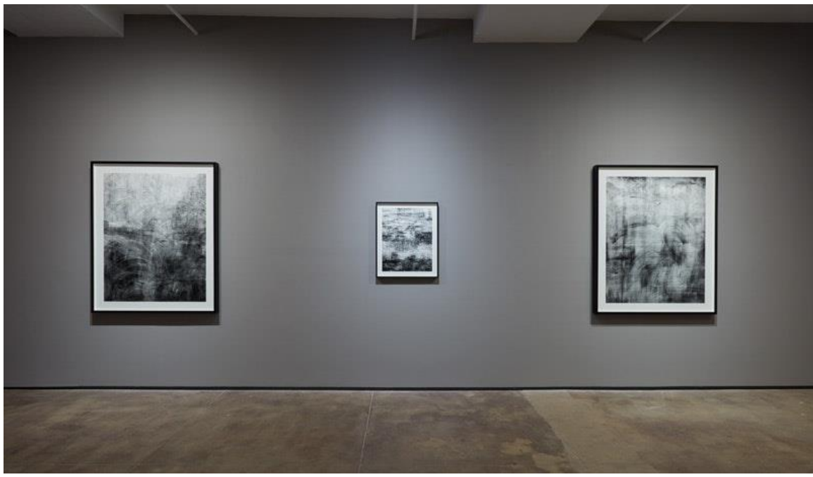
Installation view of Idris Khan: Blue Rhythms at Sean Kelly, New York, May 4 - June 22, 2019.

In the downstairs section of the gallery are assembled a series entitled "White Windows" (all circa 2019). Like the work upstairs these are framed digital photographic prints, but unlike that work these are much more fluidly expressionist. This section of the show also moves toward the fully achromatic and so subsequently Khan's graphic skills come strongly to the fore. Upon my first impression of the ensemble a colloquial memory of soaped-up windows of abandoned commercial storefronts came to mind. The same will toward an optical obliteration rules here as in the artist's text based works. The broadly brushed (wiped?) and recursive arabesques of White Windows September 2016-May 2018 (2019), for example, build in workmanlike yet impetuous folds in which subtle tonalities are achieved in an almost offhand manner. Leonardo Da Vinci's apocalyptic deluge drawings are obliquely invoked here, as are Jasper Johns's rich accumulation of visual textures in that artist's encaustic as well as graphic works. As a whole this series offers a light and welcome respite to the more portentous work upstairs and highlights Khan's ample capacity for graphic lyricism. And White Windows makes poignantly explicit his quixotic attempt to simultaneously represent and erase the passage of time's signatures.