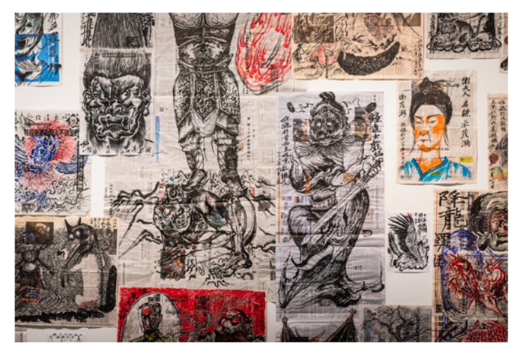
Sun Xun, Newspaper Paintings (2015–2018). Ink and colour on newspaper. Exhibition view: Sun Xun, Museum of Contemporary Art Australia, Sydney (9 July–14 October 2018).

I think if viewers manage to enter a new world, or obtain a new vision of the world, then I think I will have succeeded.