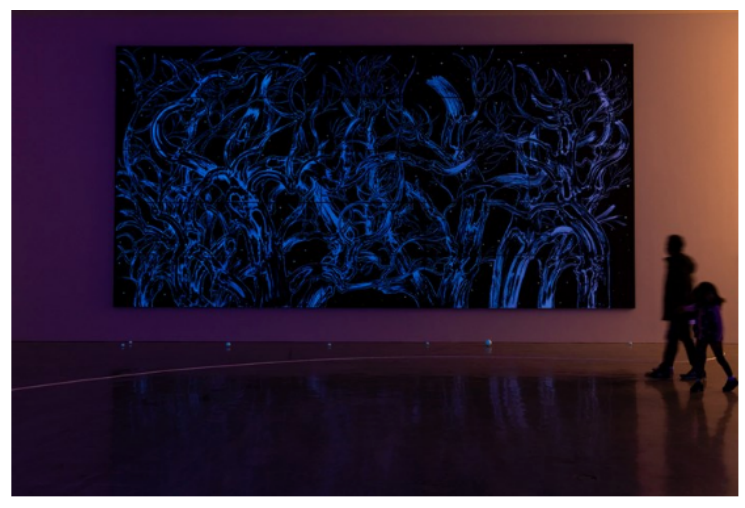
Sun Xun, Who First Saw the Stars (2018). Woodcut painting. Exhibition view: Sun Xun, Museum of Contemporary Art Australia, Sydney (9 July–14 October 2018). Commissioned by the Museum of Contemporary Art Australia and Edouard Malingue Gallery. Courtesy the artist and Museum of Contemporary Art Australia. © Sun Xun. Photo: Jacquie Manning.