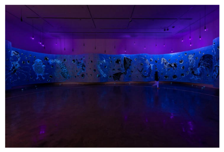
Sun Xun, Maniac Universe (2018). Mixed media on bark paper, UV-A light. Exhibition view: Sun Xun, Museum of Contemporary Art Australia, Sydney (9 July–14 October 2018). Commissioned by the Museum of Contemporary Art Australia and Edouard Malingue Gallery. Courtesy the artist and Museum of Contemporary Art Australia. © Sun Xun. Photo: Jacquie Manning.

The animation work is called Maniac Universe (2018) and is an enormous painting, over 40 metres in length, painted on handmade mulberry bark paper, talking about a parallel world as a metaphor or analogy to try and make us understand that there is always more than one thing happening at one time, and that there is always more than one opinion in circulation. I personally believe that an artist's job is not to make artwork for the present, an artist's job is to make work for the future. I also think the artist's job is to go beyond aesthetics, and use the work as a door to open people's minds.