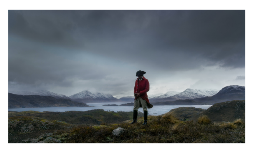
John Akomfrah, Vertigo Sea (still), 2015, three-channel HD video installation