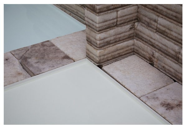
Future Fossil Spaces, 2014