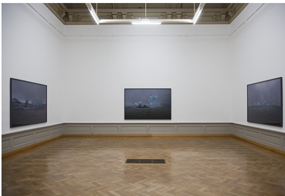
The Blue Fossil Entropic Stories, 2013