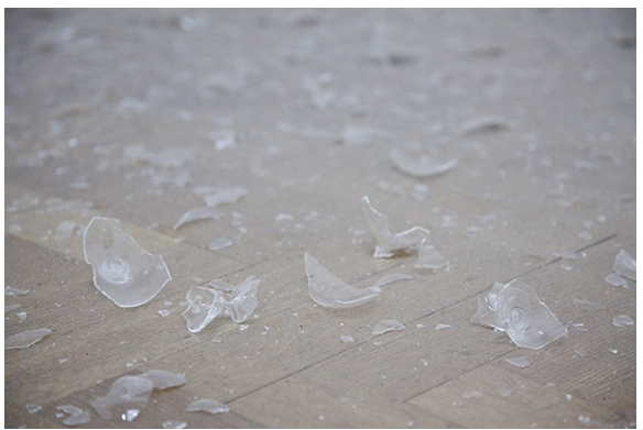
The Key to the Present Lay in the Future, 2014

Kazakhstan, at the Semipalatinsk nuclear test site, closes-or opens-the exhibition on the issue of the interdependence between humans and their environment. Entitled Somewhere , the video explores the site of the first Soviet military nuclear tests, where the radiation which was released between 1949 and 1989 remains extremely high today. The desolate and timeless aspect of these landscapes, filmed in a slow motion tracking shot by the artist without any accompanying commentary, lends an unsettling strangeness to them. The past catches up with the future in a constantly expanding present.