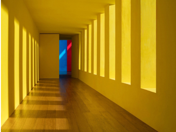
'Yellow Passage', 2017. Copyright James Casebere/SKNY. Framed archival pigment print mounted onto dibond paper, 44.5 x 66.5 inches

Firstly, apologies if I got you here under the seeming false pretence that this is some fan-based show about the Rolling Stones. It's not. It is however about an equally unlikely interpolation of title, image and context within an exhibition of new works by the much acclaimed artist, James Casebere, at Sean Kelly Gallery, NYC, until the 11th of March.