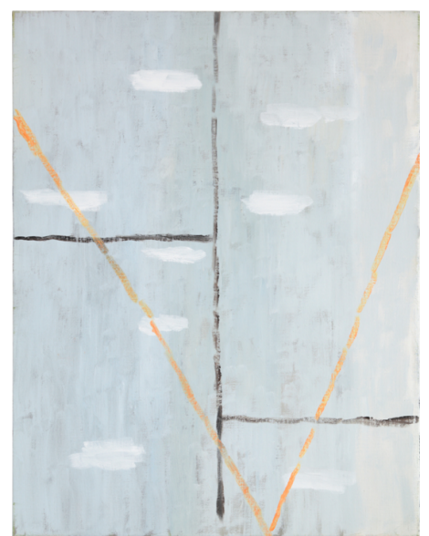
Ilse D'Hollander, Untitled , 1996. Oil on canvas. 28 x 21 5/8 in. ©The Estate of Ilse D'Hollander. Photo: Guy Braeckman, courtesy of Sean Kelly, New York.