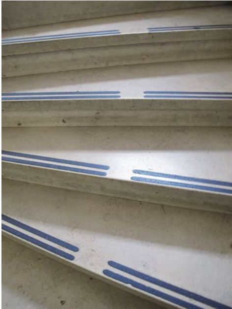
Candida Höfer Treppe Düsseldorf I 2012 C-print paper: 21 1/2 x 17 3/4 inches (54.5 x 45 cm) framed: 21 7/8 x 18 1/8 inches (55.5 x 46 cm) edition of 6 with 3 APs

From Düsseldorf by Candida Höfer From May 8th to June 20th, 2015 Sean Kelly Gallery 475 Tenth Avenue New York NY 10018