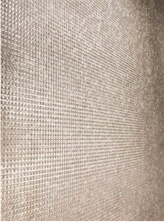
Candida Höfer Ohne Titel Düsseldorf I 2012 C-print paper: 21 1/2 x 17 3/4 inches (54.5 x 45 cm) framed: 21 7/8 x 18 1/8 inches (55.5 x 46 cm) edition of 6 with 3 APs © Candida Höfer, Köln / VG Bild-Kunst, Bonn Courtesy: Sean Kelly, New York