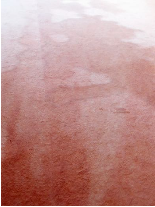
Candida Höfer Ohne Titel Düsseldorf IV 2012 C-print paper: 21 1/2 x 17 3/4 inches (54.5 x 45 cm) framed: 21 7/8 x 18 1/8 inches (55.5 x 46 cm) edition of 6 with 3 APs