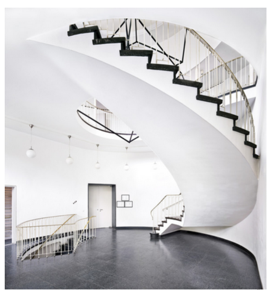
Candida Höfer's 'Malkasten Düsseldorf II' (2011).

For her show at Manhattan's Sean Kelly Gallery, Candida Höfer of Germany will exhibit about 15 photographs to demonstrate how her style has split in two