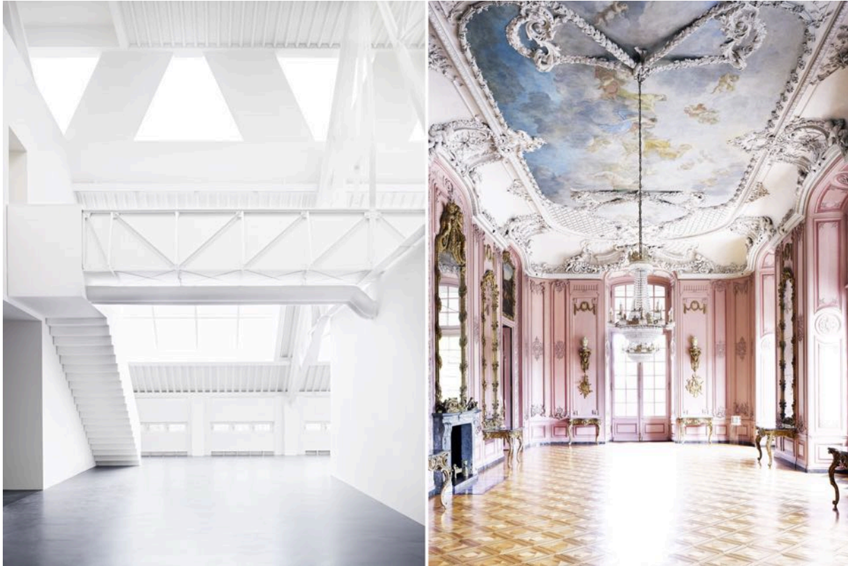
Candida Höfer, Julia Stoschek Collection Düsseldorf IVa , 2008. C-print. Paper: 200 x 158.13 cm; framed: 204 x 162.1 cm. Edition of 6 with 3 APs. © Candida Höfer, Köln / VG Bild-Kunst, Bonn. Courtesy: Sean Kelly, New York. Right: Candida Höfer, Benrather Schloss Düsseldorf I , 2011, C-print. Paper 180 x 143.4 cm; framed 184 x 147.4 cm. Edition of 6 with 3 APs. © Candida Höfer, Köln / VG Bild-Kunst, Bonn. Courtesy: Sean Kelly, New York