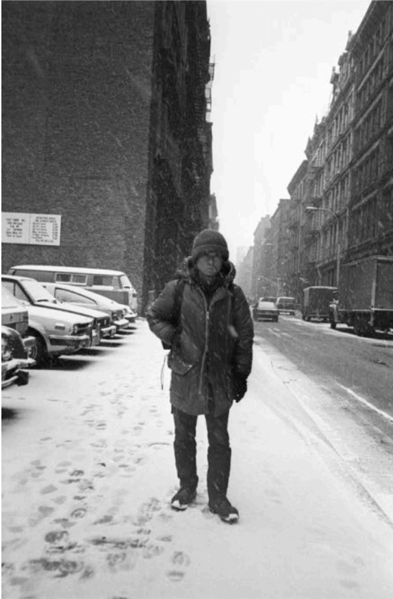
Tehching Hsieh, "One Year Performance 1981-1982," life image