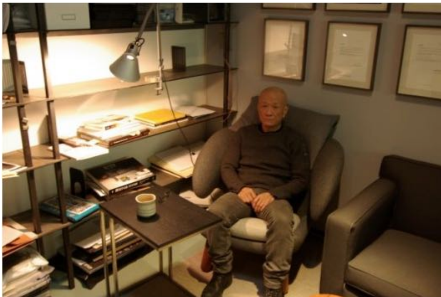
Tehching Hsieh at his studio, New York, 2015.

In 2009, 31 years after it was first undertaken in Hsieh's adopted city, the cage and documentation from "Cage Piece" were exhibited at the Museum of Modern Art. The same year, "Time Clock Piece" was featured as part of "The Third Mind: American Artists Contemplate Asia, 1860-1989" at the Solomon R. Guggenheim Museum. Further presentations of selected works have followed—but no retrospective, the form for which Hsieh envisions carefully.