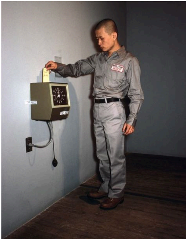
Tehching Hsieh, "One Year Performance 1980-1981," life image

TH: Well, it's not easy to complete the work, but the work is not about endurance. I pass time in an art form. I did work every hour, continuously, like breathing. It is one year, a cycle. It doesn't matter if you're creative not, or if you are poor or rich. The quantity of one year of time is the same; that is universal. I just keep the work basic, keep my life simple. But you need complexity in order to be simple.