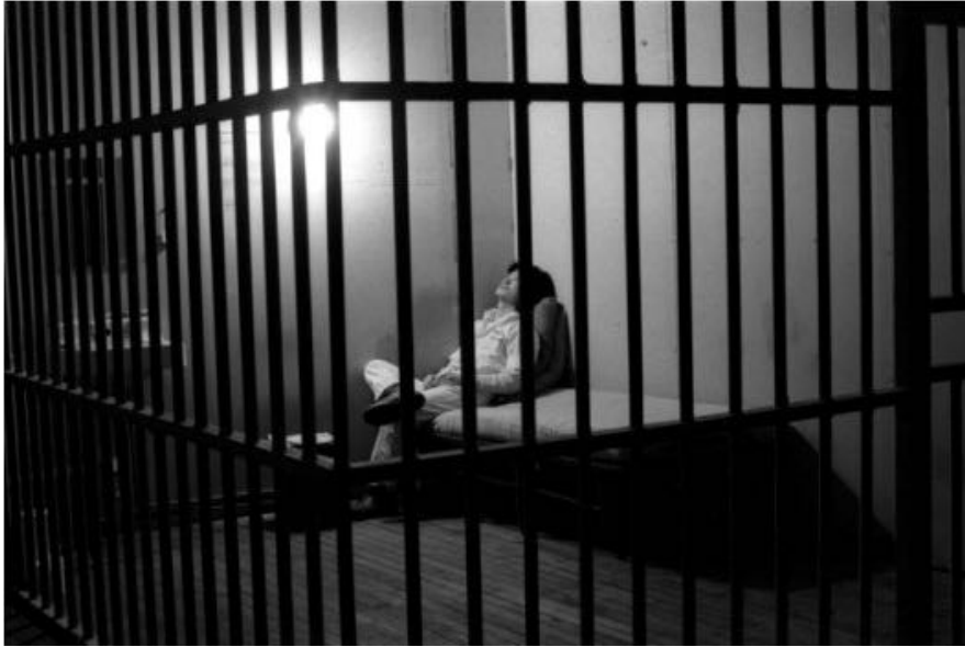
Tehching Hsieh, "One Year Performance 1978-1979," life image