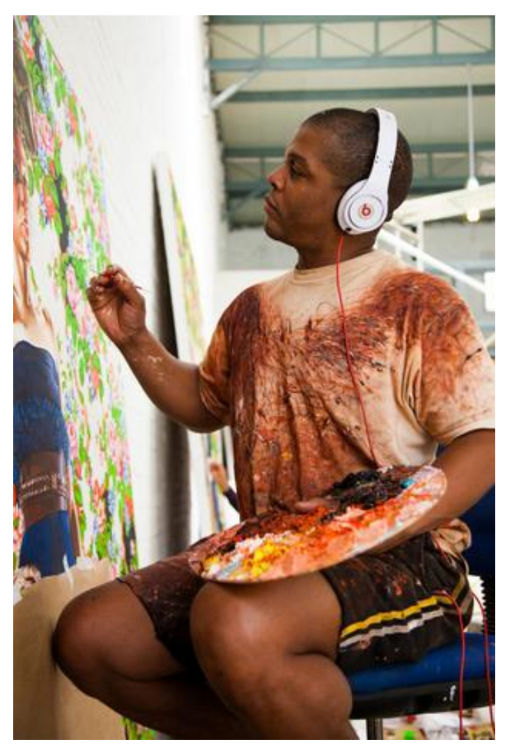
Kehinde Painting in Beijing Studio