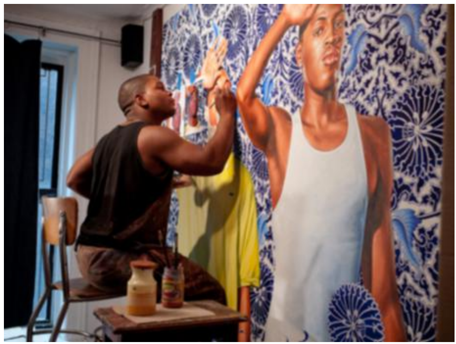
Kehinde Wiley paints in NY Studio