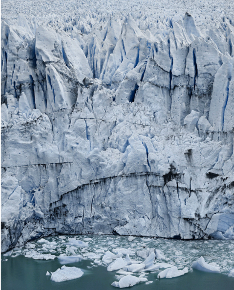
Frank Thiel, "Perito Moreno #11" (2012/2013), framed chromogenic print face mounted to Plexiglas, framed: 88 x 72 3/8 x 2 1/8 inches (223.7 x 183.7 x 5.5 cm) (© Frank Thiel / VG Bild-Kunst, Bonn, Courtesy: Sean Kelly, New York)