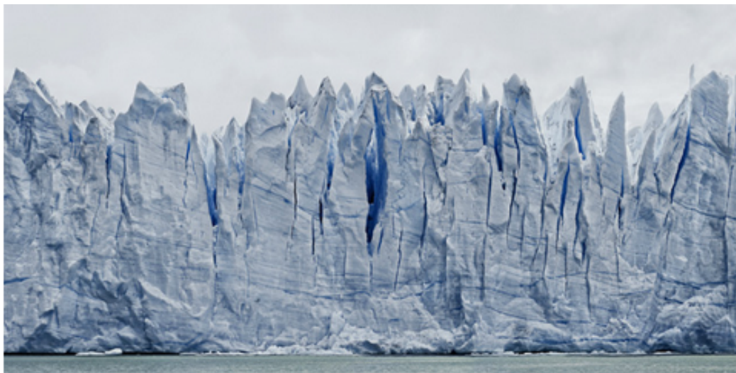
Frank Thiel, "Perito Moreno #16" (2012/2013), framed chromogenic print face mounted to Plexiglas, framed: 64 5/8 x 119 1/2 x 2 3/8 inches (164.2 x 303.7 x 6 cm) (© Frank Thiel / VG Bild-Kunst, Bonn, Courtesy: Sean Kelly, New York)