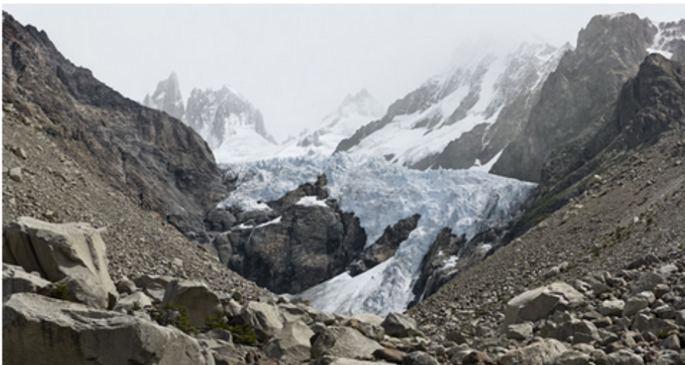
Frank Thiel, "Piedras Blancas" (2012/2013), framed chromogenic print face mounted to Plexiglas, framed: 72 1/2 x 126 1/2 x 2 3/8 inches (184.2 x 321.2 x 6 cm)

Frank Thiel's Nowhere Is the Place opens at the Sean Kelly Gallery (475 Tenth Avenue, Chelsea, Manhattan).