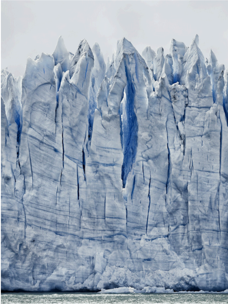
Frank Thiel, "Perito Moreno #17" (2012/2013), framed chromogenic print face mounted to Plexiglas, framed: 84 1/8 x 64 7/8 x 2 1/8 inches (213.7 x 164.7 x 5.5 cm) (© Frank Thiel / VG Bild-Kunst, Bonn, Courtesy: Sean Kelly, New York)