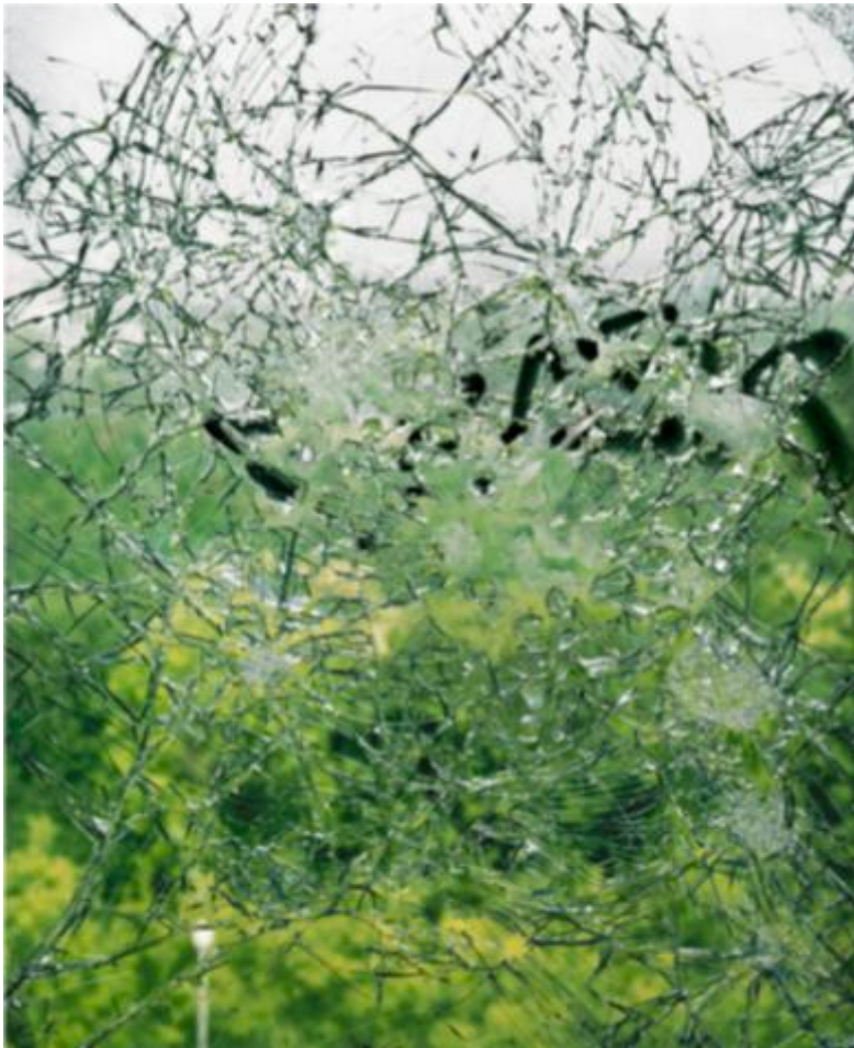
untitled (NSA Field Station, Berlin, Teufelsberg #14), 2005