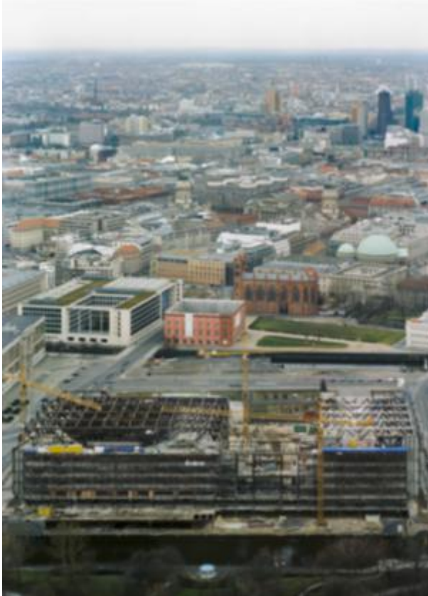
untitled (Palast der Republik #33), 2007