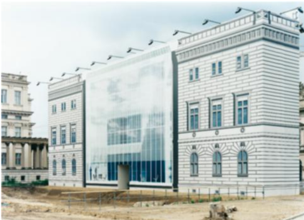
Digital simulation mounted on scaffolding. Bertelsmann Media Group bought the land with the prestigious address Unter den Linden 1 to build a new representative headquarter in the German capital. The building is a mix of the reconstruction of Berlin's former Stadtkommandantur or city garrison headquarters, which stood on that land historically, but did not survive WWII. This is the modern rear view. During Bertelsmann's annual summer event, a huge party tent was erected behind the simulation. Limousines stopped in front, and guests literally walked through the simulation into the party tent.