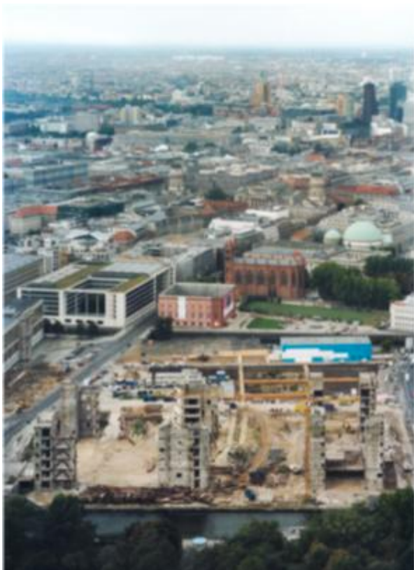
untitled (Palast der Republik #47), 2008