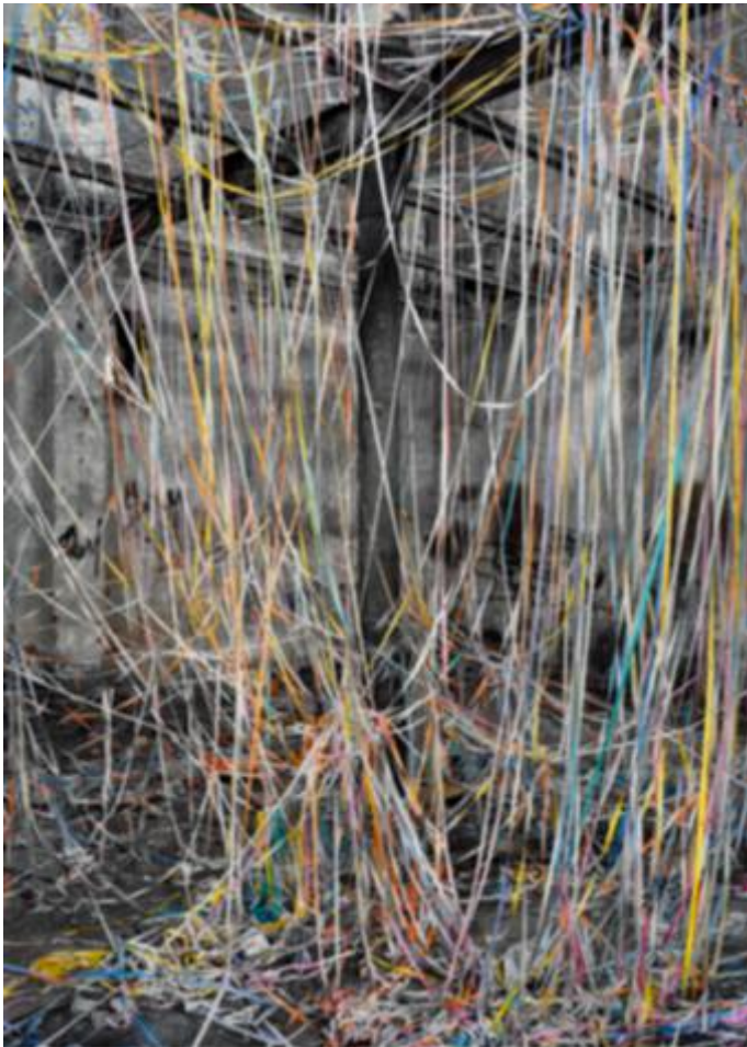
Stadt 16/01 (Berlin), 2011