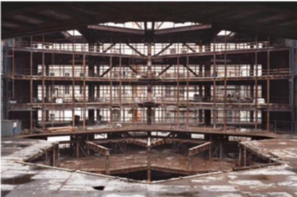
untitled (Palast der Republik #28), 2007