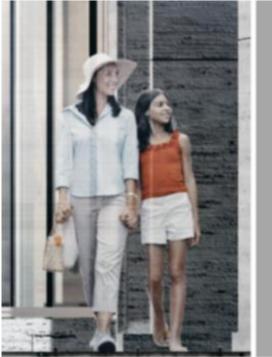
Detail of an investor's digital simulation of a new shopping center at Leipziger Platz (Berlin-Mitte).