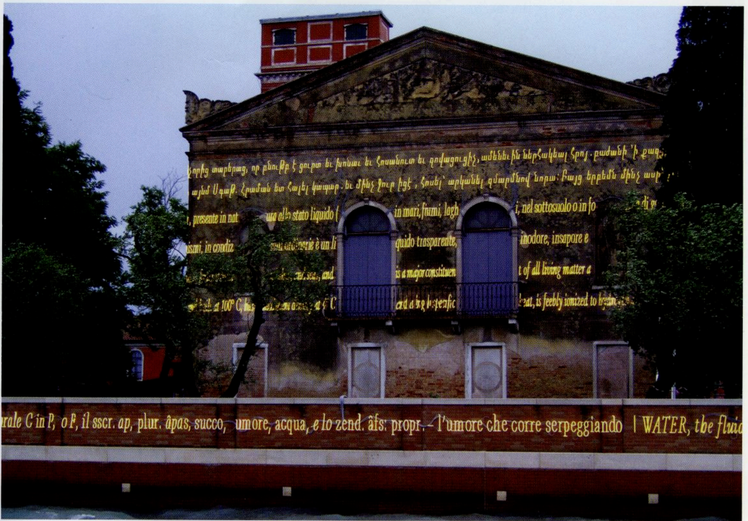
Opposite, left: A Last Parting Look , 2005. Opposite, right: One and Three Photographs [Ety./Hist.] , 1965. Above: The Language Equilibrium , 2006. Below: Information Room (Special Investigation) , 1970.