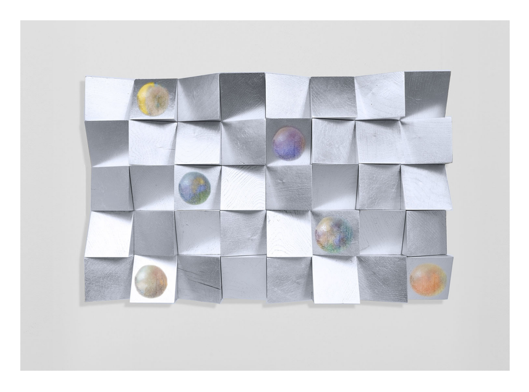
Image Caption: Laurent Grasso, Anechoic Wall , 2018, oil and white gold leaf on wood, 13 3/4 x 22 1/16 x 1 9/16 inches © Laurent Grasso/ADAGP, Paris 2017, Courtesy: Sean Kelly, New York