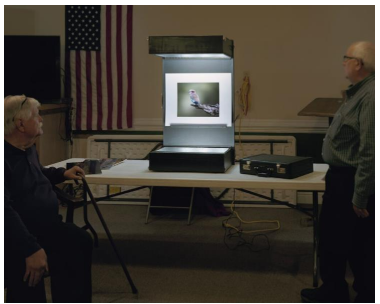
CAMERA CLUB. WASHINGTON, PENNSYLVANIA, 2019, ARCHIVAL PIGMENT PRINT, 24 X 30".