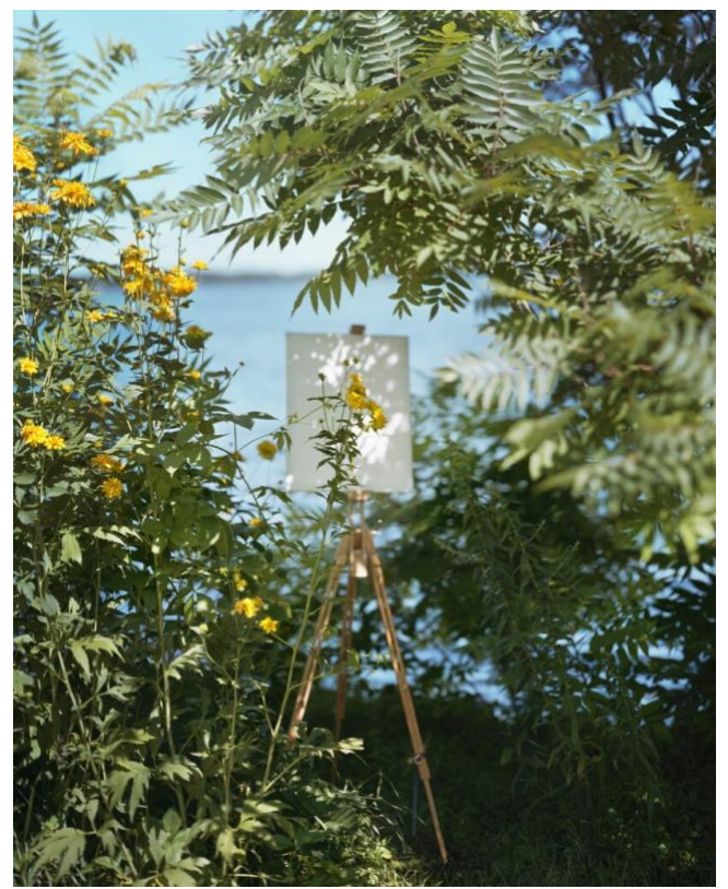
WHITE BEAR LAKE, MINNESOTA, 2019, ARCHIVAL PIGMENT PRINT, 40 X 32".