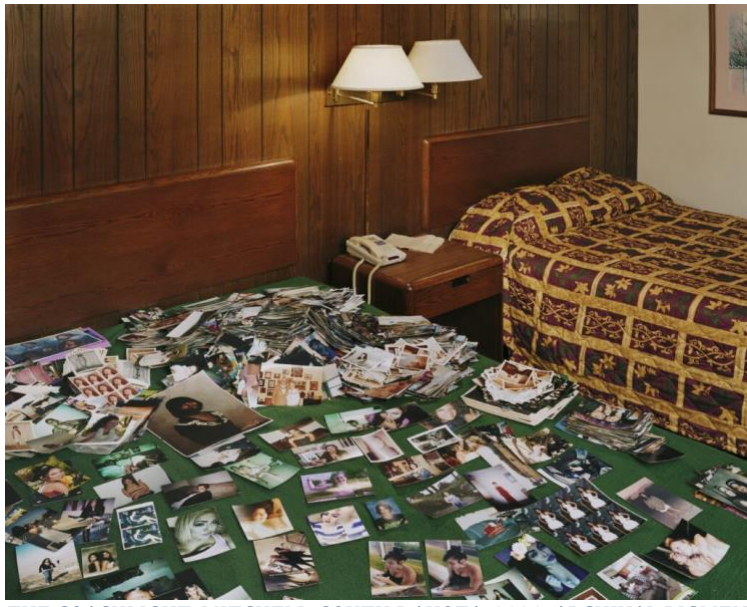
THE COACHLIGHT. MITCHELL, SOUTH DAKOTA, 2020, ARCHIVAL PIGMENT PRINT, 40 X 50".