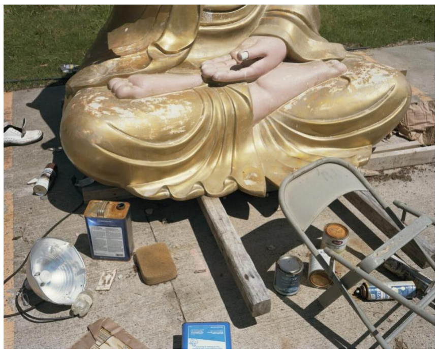
ALEC SOTH, QUAN AM MONASTERY. MEMPHIS, TENNESSEE, 2021, ARCHIVAL PIGMENT PRINT, 24 X 30".

On his travels across the United States, the photographer Alec Soth likes to visit Buddhist temples and sometimes to ask the monks if photography, with its "desire to stop and possess time," is antithetical to their teachings. He reports that the response is often some variation on "No, I love taking pictures!" After one such interaction in Connecticut, he found that the monk in question had even tagged him in a photo on Facebook. The average American monk, it seems, isn't concerned about whether the photographic impulse may be a neurotic one born of upādāna, or worldly attachment. Soth, though, clearly is.