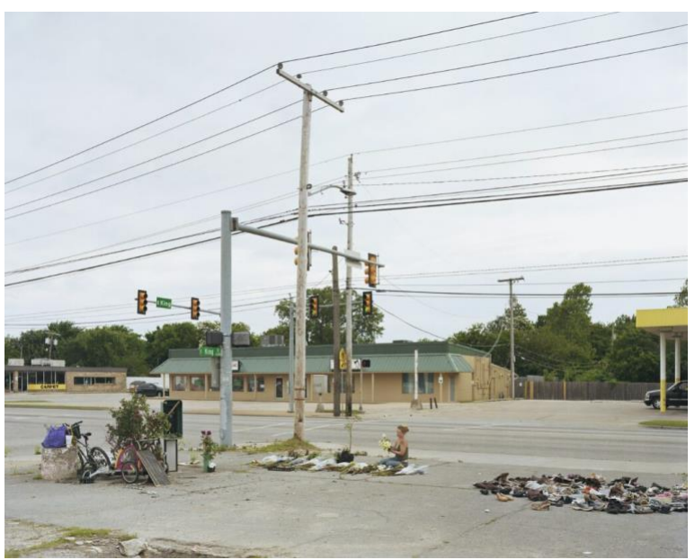
KING & SHERIDAN, TULSA, OKLAHOMA, 2021, ARCHIVAL PIGMENT PRINT, 52 X 65".