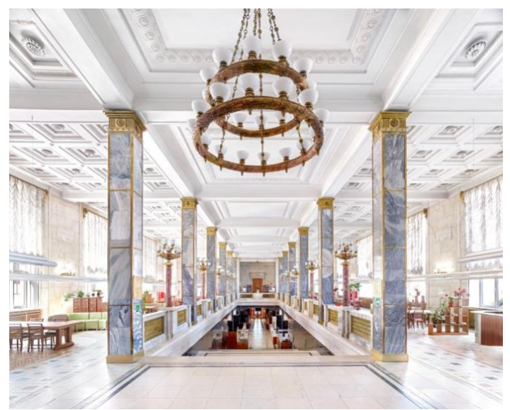
'Rossiskaya Gosudarstvennaya Biblioteka (Russian State Library) Moskwa II' 2017

handrail) spiralling downwards. In the home, however, emptiness implies something more personal. An empty home suggests a sadder story.