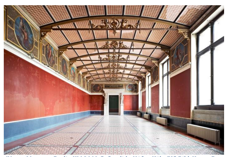
'Neues Museum, Berlin XL' 2009

Quietude provides the subtext to much of Höfer's work. She can turn Yale reading rooms into a modern monastery. Many of her scenes are like sanctuaries. "If and when I have been in a room full of people recently, I have tried to get out," Höfer acknowledges. "I occasionally empty a room mentally if it asks for it, even rooms without people, emptying them from signposts, cordons, benches and other paraphernalia." There is often a large void in the centre foreground of her compositions. Höfer can take comfort in kindred spirits from art history. The 19th-century Danish painter Vilhelm Hammershoi produced canvases of still, near-monochrome, unoccupied rooms — painted in his own apartment in Copenhagen — in which he edited out not just people and furniture but door handles and hinges. In one, the primary focus of the work is a swirl of dust motes caught in the sunlight.