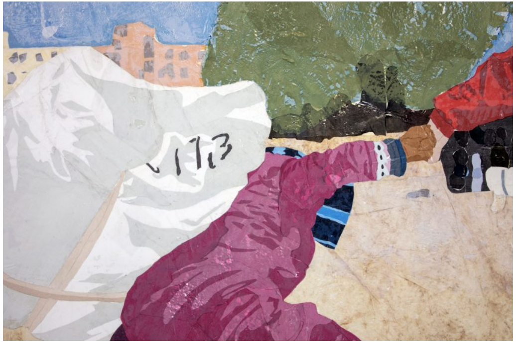
Together shows women carrying goods across the border of Ceuta, a Spanish autonomous city in Morocco