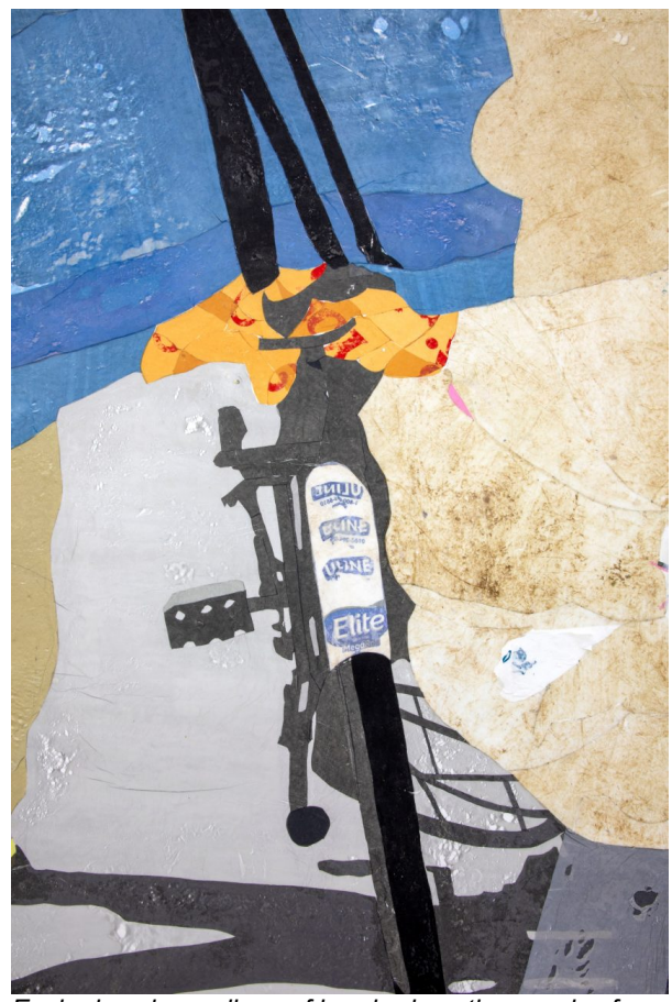
Each piece is a collage of hundreds or thousands of small plastic shreds

Based on photographs found on the internet, the collages depict the movement of people and goods around the world, from workers transporting wares on their backs and bikes to refugees attempting to cross the Mediterranean Sea by boat.