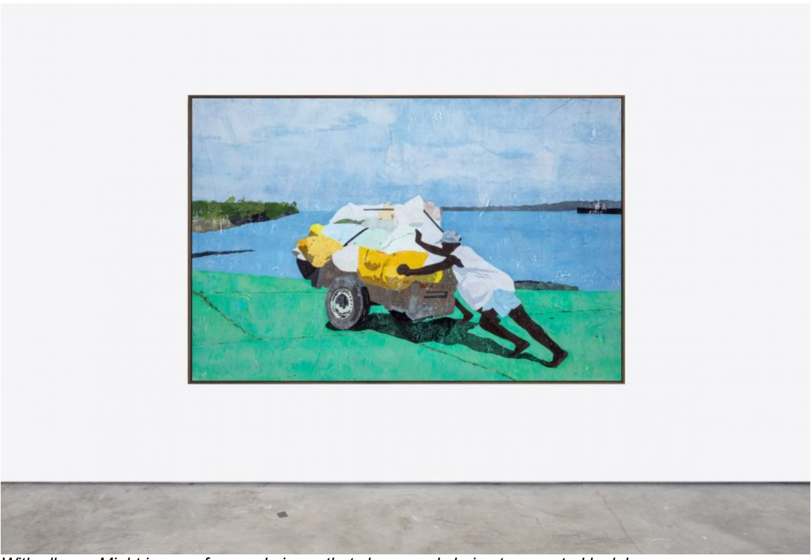
With all your Might is one of several pieces that show goods being transported by labourers

The exhibition also includes a mini-series of collages showing flower arrangements, which McCloud made to offer the show's visitors and himself a moment of respite from the dispiriting news cycles and monotony of lockdown.