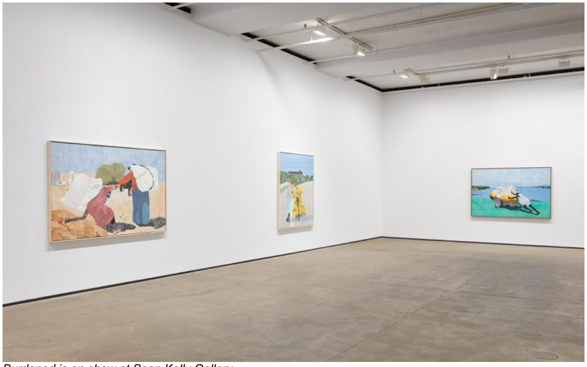
Burdened is on show at Sean Kelly Gallery

These are individually cut from plastic bags and layered on top of each other, much like individual brush strokes, before being fused together with an iron.