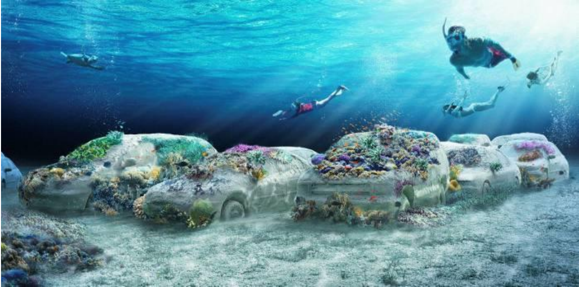
Rendering of Leandro Erlich's 'Concrete Coral' for The ReefLine © Leandro Erlich Studio

The founder and artistic director of the art project and snorkel trail, Ximena Caminos, commented: "This series of artist-designed and scientist-informed artificial reefs will demonstrate to the world how tourism, artistic expression, and the creation of critical habitat can be aligned."