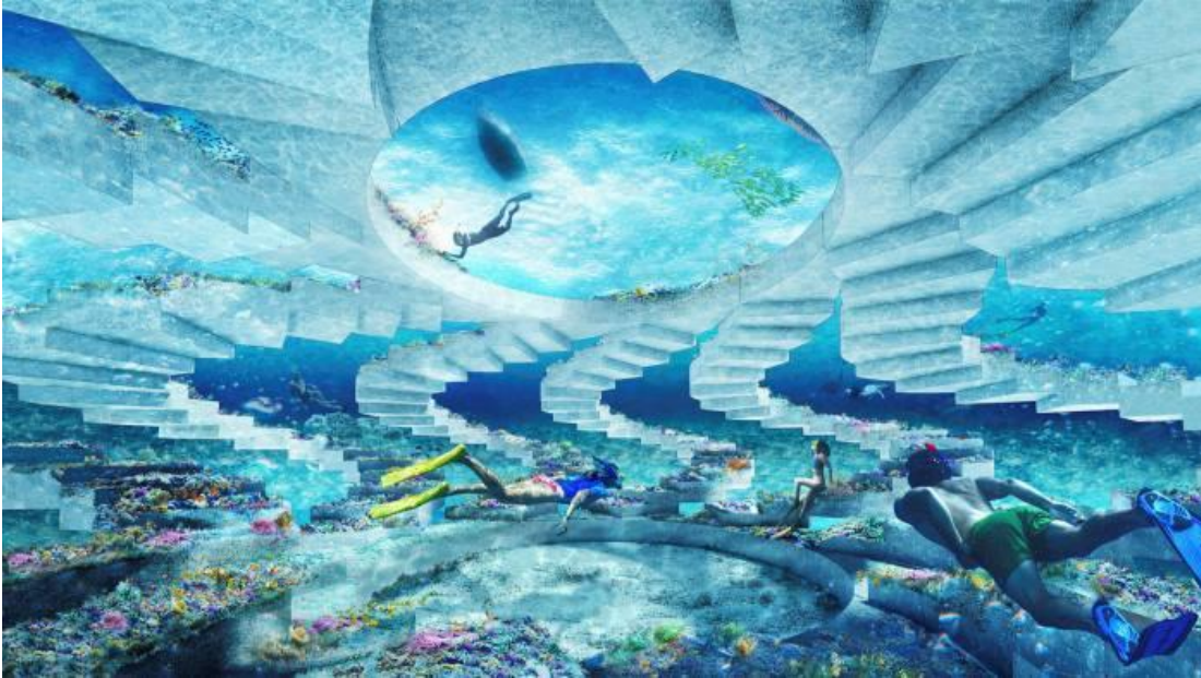
Rendering of OMA Installation for The ReefLine © OMA

The first mile, to be opened in December 2021, will include permanent installations from Argentine conceptual artist Leandro Erlich and Shigematsu. Erlich will create a version of “Traffic Jam” — which was originally showcased as part of Art Week Miami Beach last year — a work that placed across the beach life-size cars that appear as if built with sand. “Concrete Coral” will similarly riff on cars (a key source of emissions), but using them instead as an opportunity for environmental change. Shigematsu’s sculpture, meanwhile, will explore weightlessness: playing with the futile visual of stairs underwater.