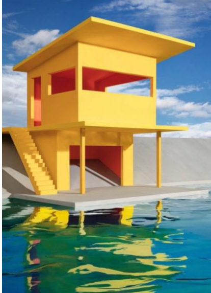
James Casebere, Bright Yellow House on Water, 2018.

Borders, ecological crisis and the human condition. These are the themes explored in this week's recommended viewing – spanning portraiture, documentary and illusion. Artists from across the globe hold up a mirror to the world through photography. Model making, staged scenarios and candid images come together in an interpretation of the modern world.