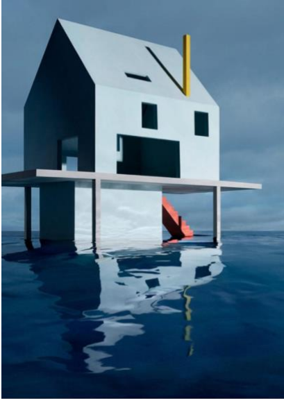
James Casebere, Blue House on Water #2, 2018.