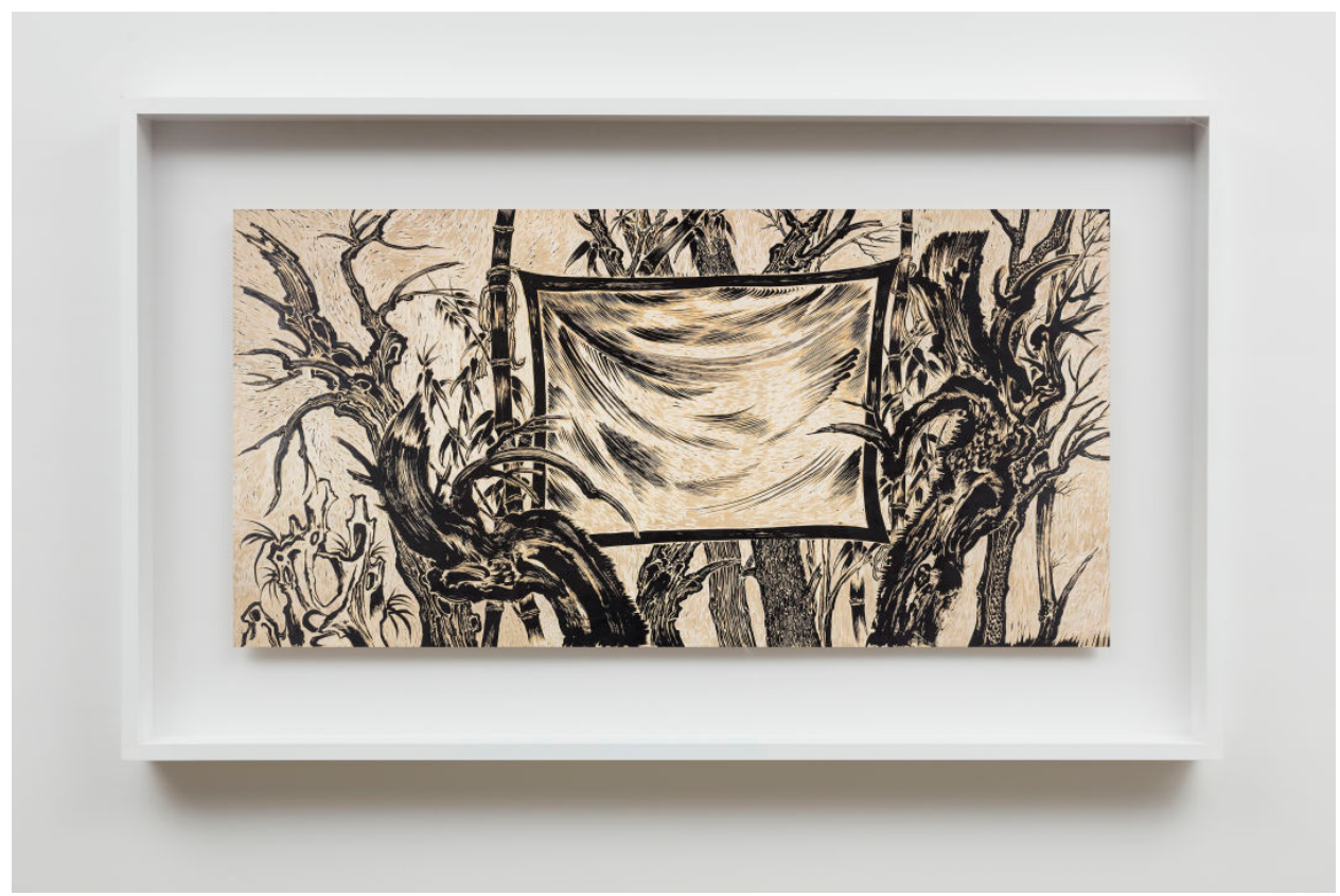
Time Spy woodcut painting. Copyright the artist.

Also old-school: the stereoscopic technique that uses red and cyan to render the film in three dimensions. (The museum will provide tinted glasses to watch Time Spy. ) And Xun adheres to the tradition of emphasizing long-running Chinese themes like the five elements (metal, wood, water, fire and earth) in his exploration of the nature of time.