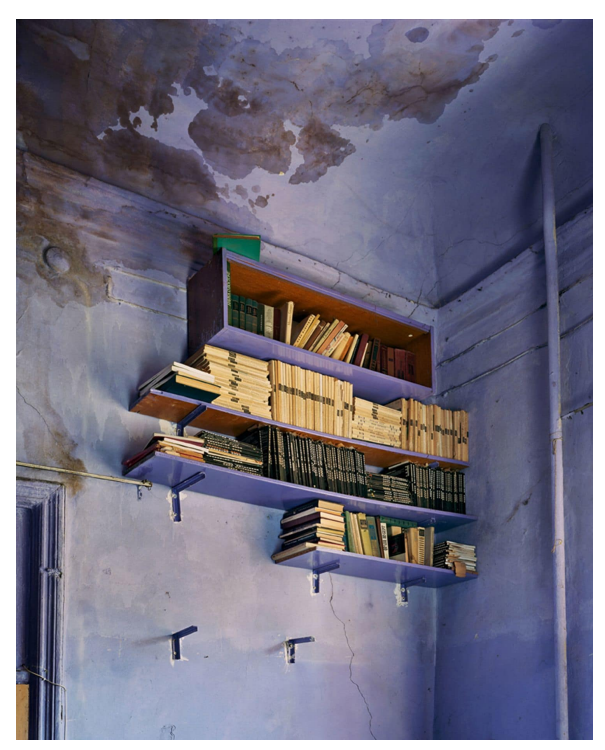
"Ute's Books. Odessa." From "I Know How Furiously Your Heart is Beating" (2019).