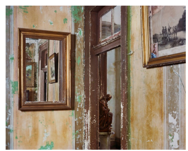
"Mao's. New Orleans." From "I Know How Furiously Your Heart is Beating" (2019).