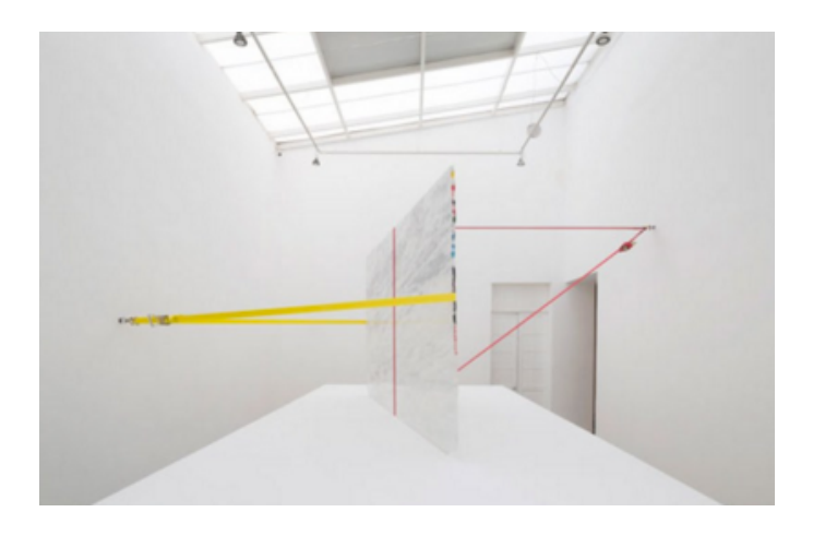
Allure (rojo y amarillo), 2014