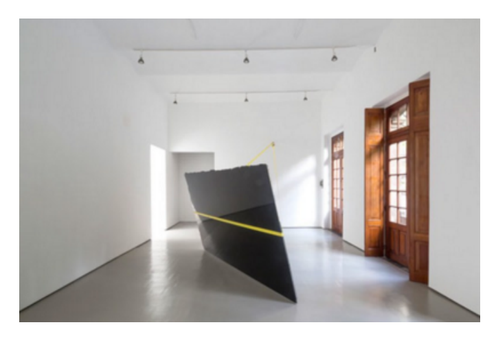
Zimbabue (amarillo), 2014