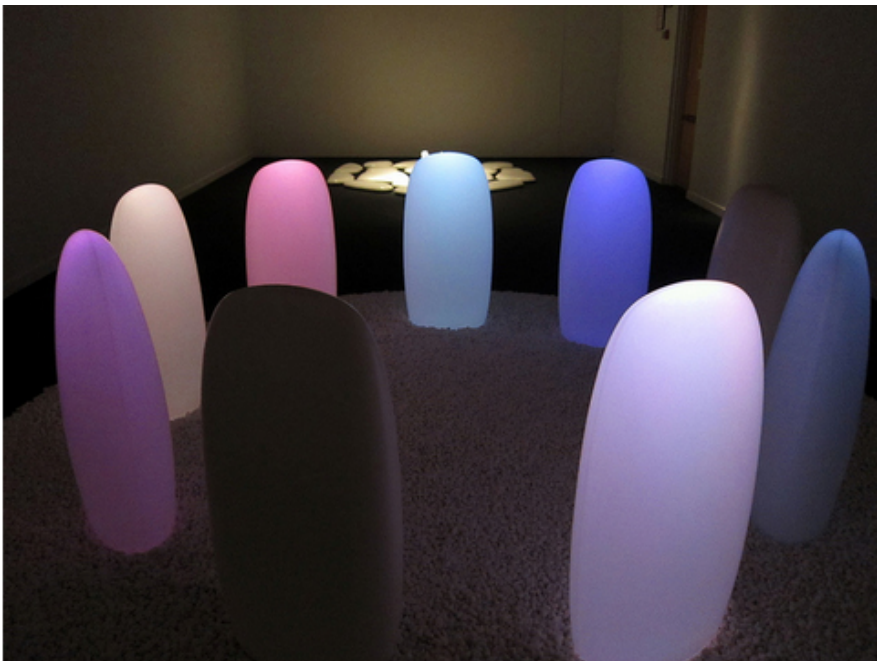
Mariko Mori, "Transcircle 1.1" (2004), stone, corian, LED, real-time control system

This movement of time is most effective at the beginning and the end, where first you enter a dark stage of death heavily inspired by ancient <u>Jōmon</u> culture (14,000–300 BCE). A beautiful Jōmon earthenware vase that curls up at the edges like the flames that it was fired from stands at one corner of the first gallery, while in the center is Mori's interpretation of a Jōmon stone formation meant to align with the winter solstice. An acrylic cast of a Jōmon mask looms above with one eye scratched out according to the culture's belief that nothing is symmetrical, everything has in it both death and life. Mori's piece, called "Primal Memory" (2004), seems to glow from within, but if you turned off the light the pile of lucite would look like nothing special, it's only with the angle of illumination that it comes to life. In the piece is this connection to the ancient rock formations that meant to capture something of the grand movement of the stars in some lowly stones. "She thinks of all of her work as a device," Tezuka said. "Here she wants to bring in materials that are from our time, in a way combining the past and the present."