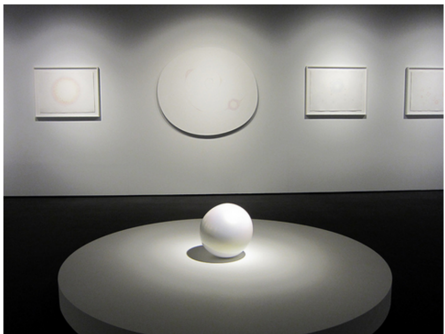
Mariko Mori, "Tama I" (2011), epoxy with pearlescent finish in front of drawings by Mori

This movement of time is most effective at the beginning and the end, where first you enter a dark stage of death heavily inspired by ancient <u>Jōmon</u> culture (14,000–300 BCE). A beautiful Jōmon earthenware vase that curls up at the edges like the flames that it was fired from stands at one corner of the first gallery, while in the center is Mori's interpretation of a Jōmon stone formation meant to align with the winter solstice. An acrylic cast of a Jōmon mask looms above with one eye scratched out according to the culture's belief that nothing is symmetrical, everything has in it both death and life. Mori's piece, called "Primal Memory" (2004), seems to glow from within, but if you turned off the light the pile of lucite would look like nothing special, it's only with the angle of illumination that it comes to life. In the piece is this connection to the ancient rock formations that meant to capture something of the grand movement of the stars in some lowly stones. "She thinks of all of her work as a device," Tezuka said. "Here she wants to bring in materials that are from our time, in a way combining the past and the present."