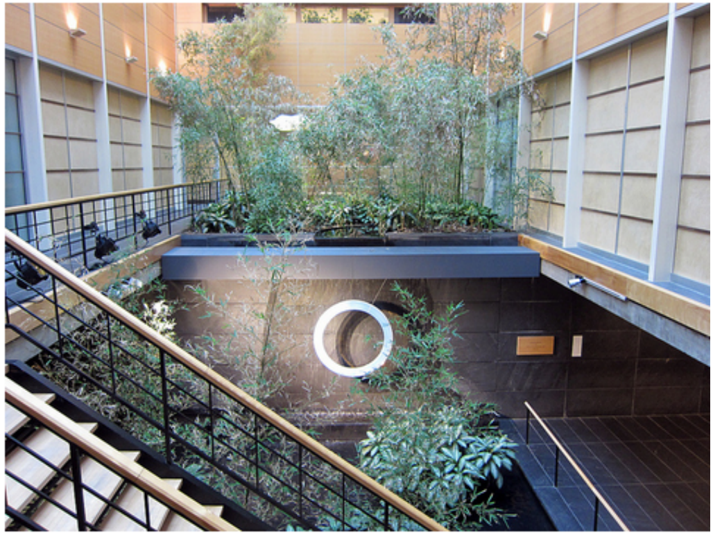
Mariko Mori, "Ring" (2012), lucite, installed in the indoor garden of the Japan Society

Nearby, a ring of Celtic-influenced miniature monoliths called "Transcircle 1.1" (2004) has pastel LED hues that shift color based on the path of the planets, sometimes absorbing each other into new shades when their year-long trajectories around the sun align, and a beautiful installation called "Flatstone" mimics the structure of a Jōmon temple. Then the next stage takes the visitor into a rebirth through Buddhism enlightenment. From a window to the interior garden are two sculptures, one two birds entwined in flight and another a glowing ring over a waterfall. The little ring might not be the most visually compelling thing in the show, but it's a hint at what is perhaps Mori's most compelling current project.