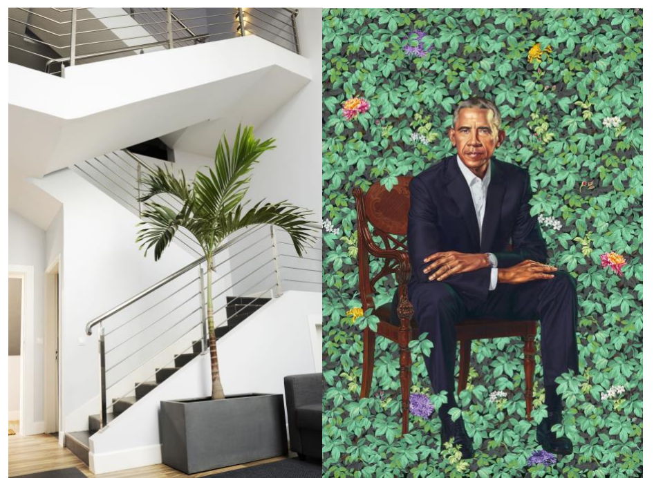
(Left) Detail of apartment for visiting artists, 2019. (c) Kehinde Wiley. (Right) Kehinde Wiley, Barack Obama, 2018. © 2018 Kehinde Wiley.

Once the residency's first round of artists begin arriving this summer (the application period recently closed, and the selected names have not yet been released), Wiley imagines a residency program that can grow and evolve organically. "The program will be open to all manner of creative forms—with an emphasis on painting, because that's my strong point," he said. "As the project continues expanding, it will have a digital lab and access to explore food in the chef's kitchen, with the goal of developing it beyond just the plastic arts to have a truly 360-degree engagement with the creative culture."