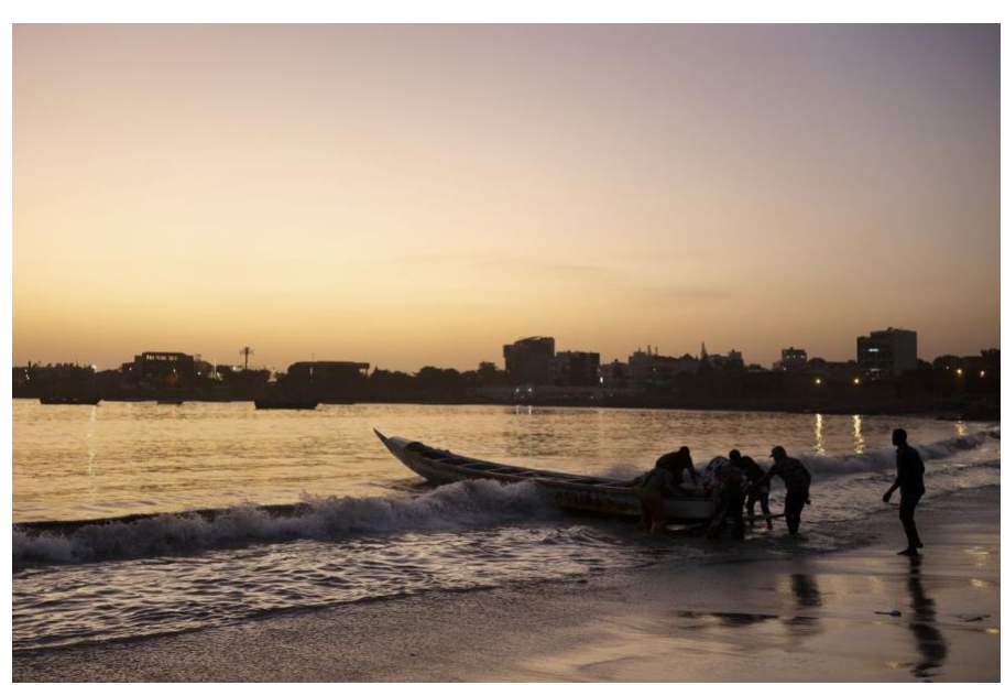
Fishermen pulling a boat up to Soumbedione Fish Market, Dakar, 2019. © Kehinde Wiley. Used by permission.

Plenty of amenities exist to help that fellowship along—including private residences; an infinity pool; a kitchen with a private chef; a gym; and a spa. "The living spaces were designed so that maximum interaction and maximum privacy are attended to at once," Wiley said. Each artist has their own three-story townhouse equipped with a fully stocked kitchen, a living room space for small gatherings, a bedroom with a private desk space, and two bathrooms. The studios were designed so that artists have intimate proximity between their apartments and their workspaces.