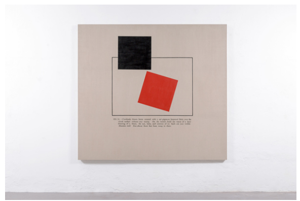
Jose Dávila, Untitled, 2015. Acrylic and vinyl paint on loomstate linen, 200 x 220 cm., Courtesy of Galería Travesía Cuatro, Madrid, 2015. Photo: Agustín Arce.

"The idea," he relates, "is that the pieces should present themselves in different contexts. Then, after eight months, they return and form the cube again. The cube will say something about how LA as a city is made up of many mini-cities."