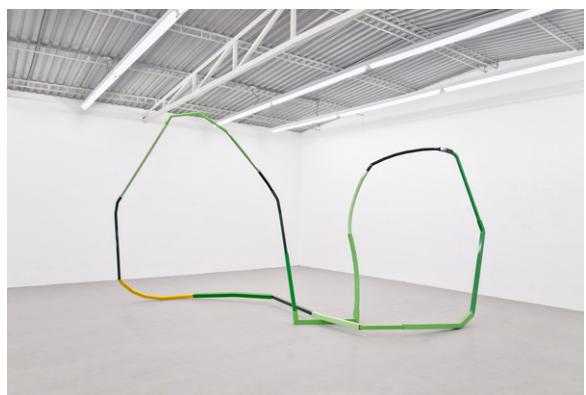
Jose Dávila, Daylight Found Me with No Answer, 2013. Metal frames and enamel paint, 550 x 250 x 270 cm., Courtesy of Galleri Nicolai Wallner, Copenhagen, 2015. Photo: Alejandra Jaimes

His studio is located on Colonia Artesanos in downtown Guadalajara in a workshop neighborhood whose chaotic atmosphere signifies what many consider to be a specifically Mexican aesthetic. Daylight Found Me with No Answer is also the name of a Dávila sculpture made of twisted metal frames.