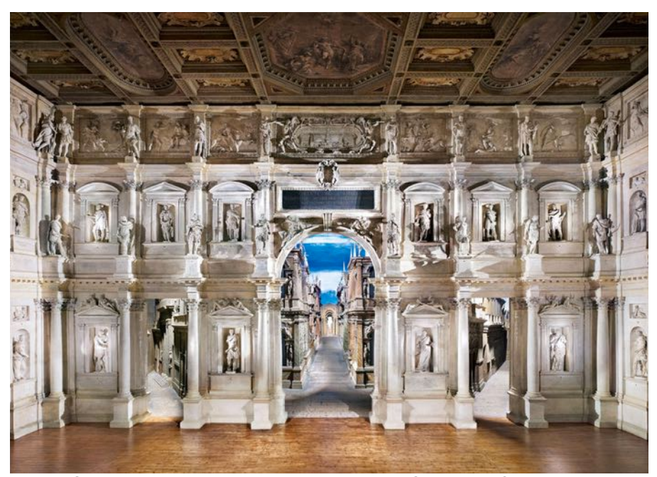
Teatro Olimpico Vicenza II 2010, 180 x 235cm. Courtesy of Ben Brown Fine Arts ©2013 Candida Höfer, VG Bild-Kunst