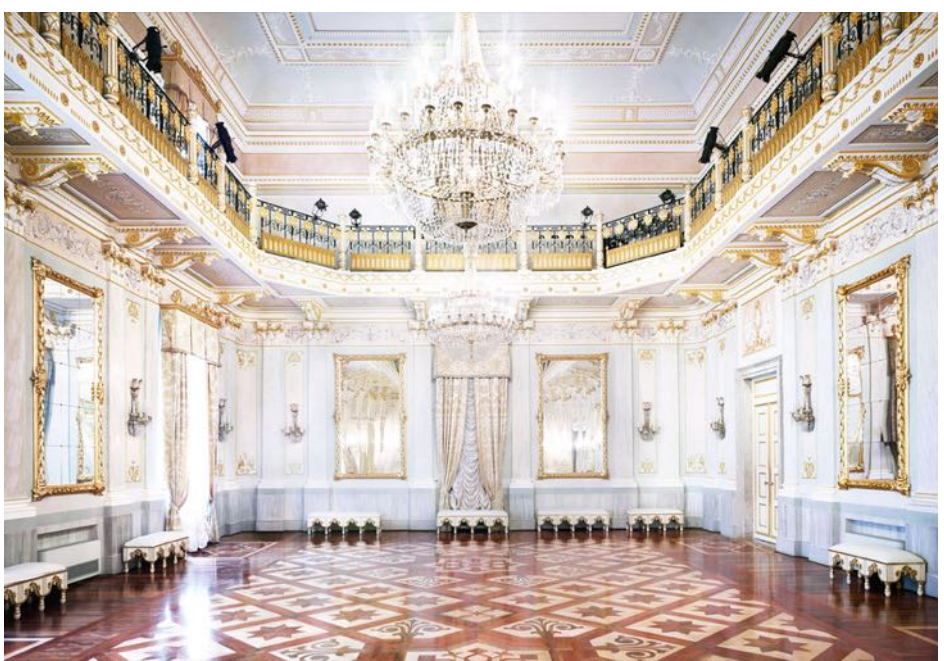
Teatro La Fenice di Venezia III 2011, 180 x 242cm. Courtesy of Ben Brown Fine Arts ©2013 Candida Höfer, VG Bild-Kunst