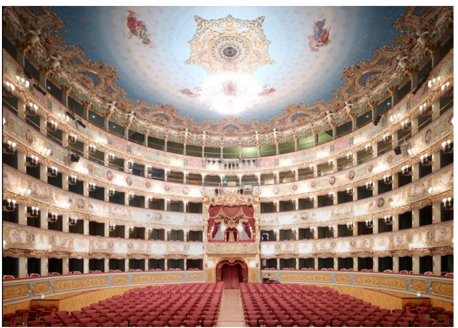
Teatro La Fenice Di Venezia V 2011. Courtesy of Ben Brown Fine Arts ©2013 Candida Höfer, VG Bild-Kunst