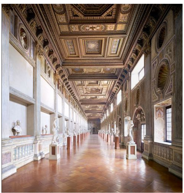
Palazzo Ducale Mantova V 2011, 180 x 176cm. Courtesy of Ben Brown Fine Arts ©2013 Candida Höfer, VG Bild-Kunst