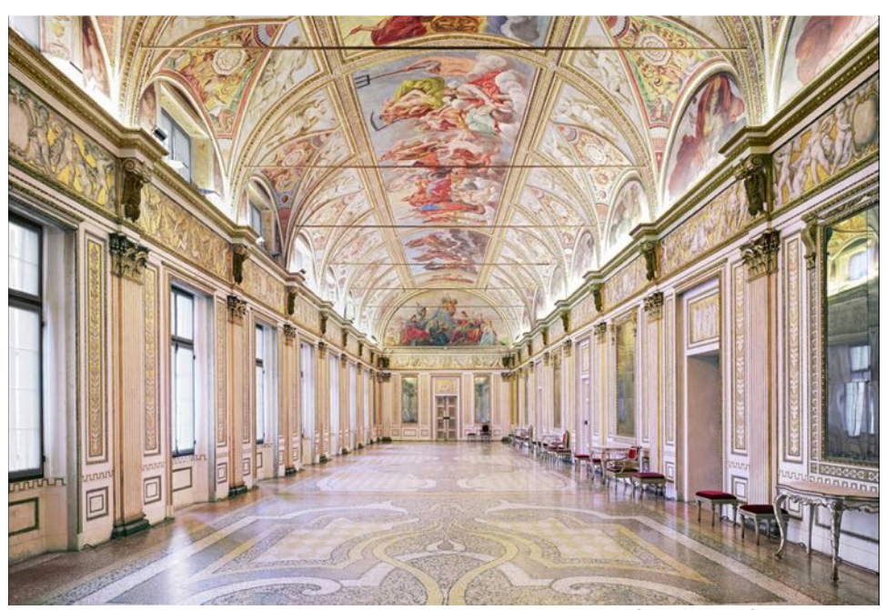
alazzo Ducale Mantova IPalazzo Ducale Mantova I 2011. Courtesy of Ben Brown Fine Arts ©2013 Candida Höfer, VG Bild-Kunst