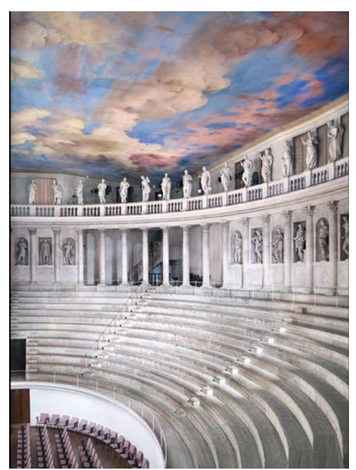
Teatro Olimpico Vicenza III 2010, 180 x 144cm. Courtesy of Ben Brown Fine Arts ©2013 Candida Höfer, VG Bild-Kunst