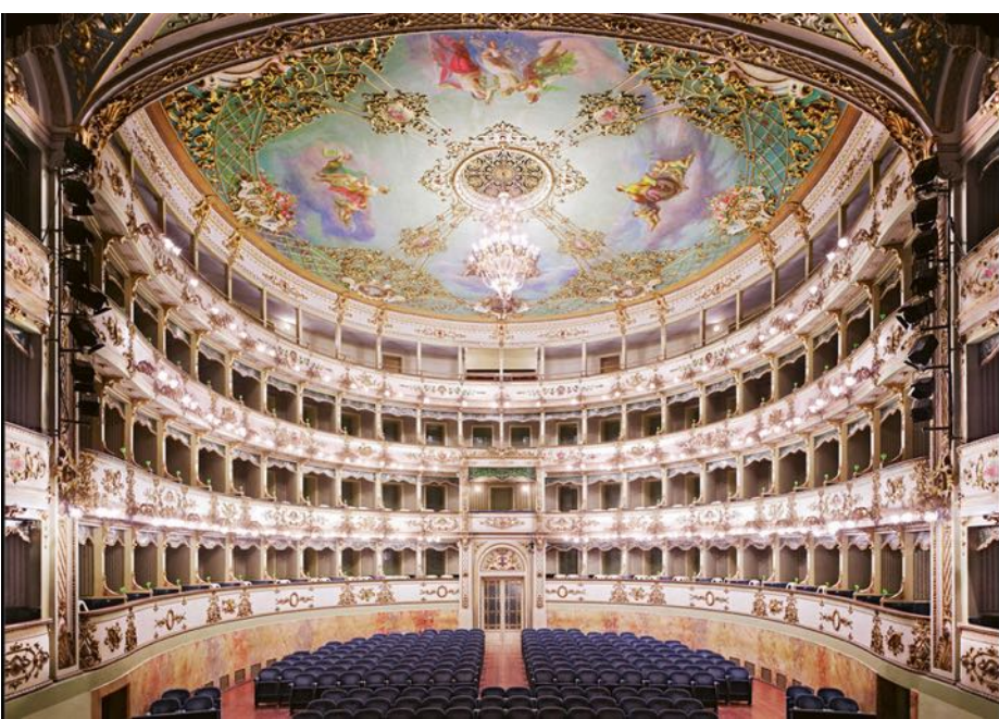
Teatro Comunale di Carpi I 2011. Courtesy of Ben Brown Fine Arts ©2013 Candida Höfer, VG Bild-Kunst