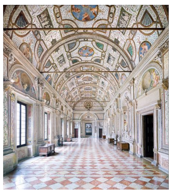
Palazzo Ducale Mantova IVPalazzo Ducale Mantova IV 2011, 180 x 176cm. Courtesy of Ben Brown Fine Arts©2013 Candida Höfer, VG Bild-Kunst