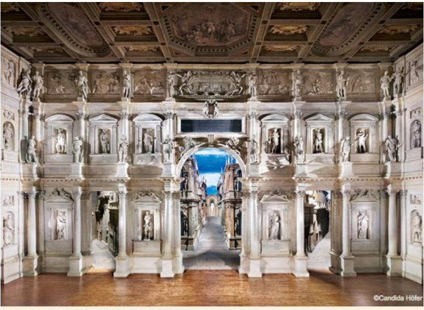
Teatro Olimpico Vicenza II, 2010, 180 x 235cm

In a new exhibition by the leading German photographer Candida Höfer, her cool, objective view reveals the inner drama of some of the most spectacular buildings of the Italian Renaissance