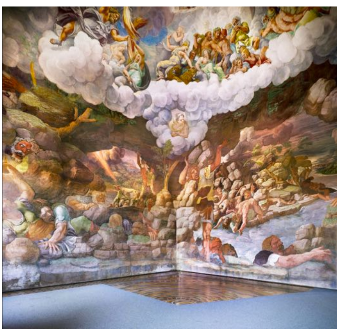
Museo Civico Di Palazzo Te Mantova IV 2010, 180 x 187cm. Courtesy of Ben Brown Fine Arts ©2013 Candida Höfer, VG Bild-Kunst