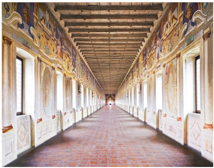
Galleria Degli Antichi Sabbioneta I 2010, 180 x 220.7cm. Courtesy of Ben Brown Fine Arts ©2013 Candida Höfer, VG Bild-Kunst