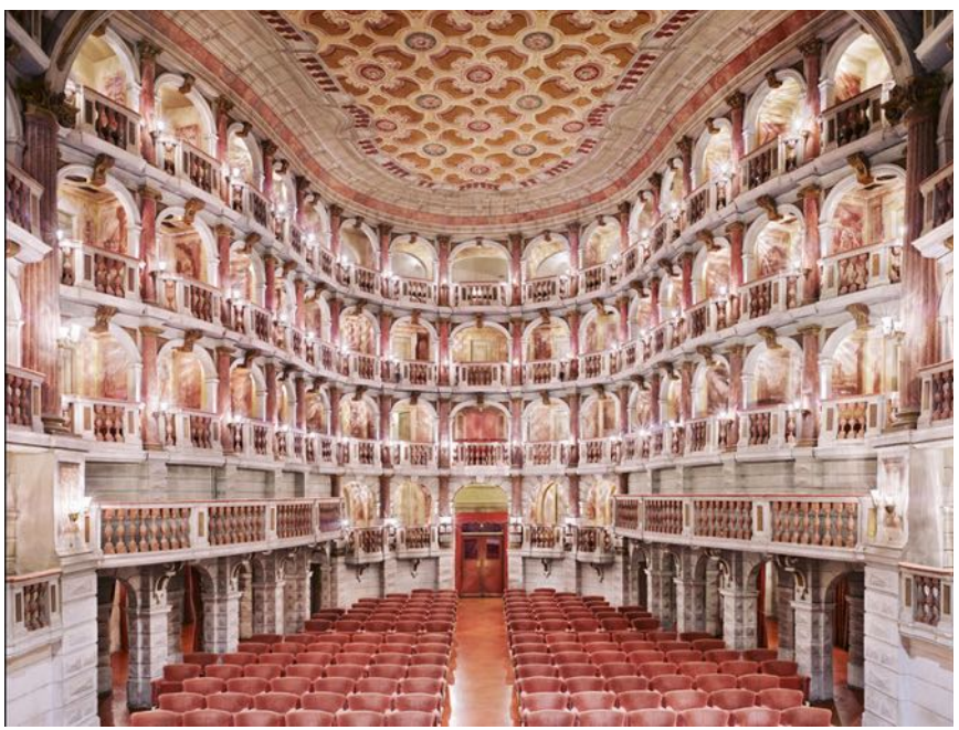
Teatro Scientifico Bibiena Mantova I 2010.