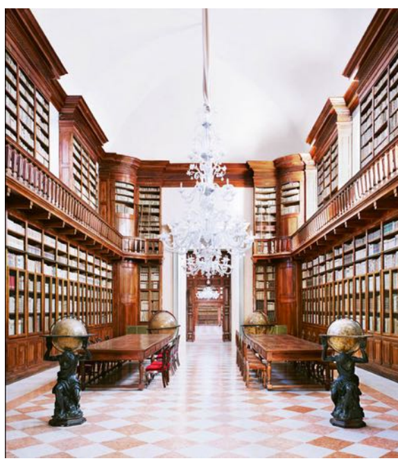
Biblioteca Teresiana Mantova I 2010.