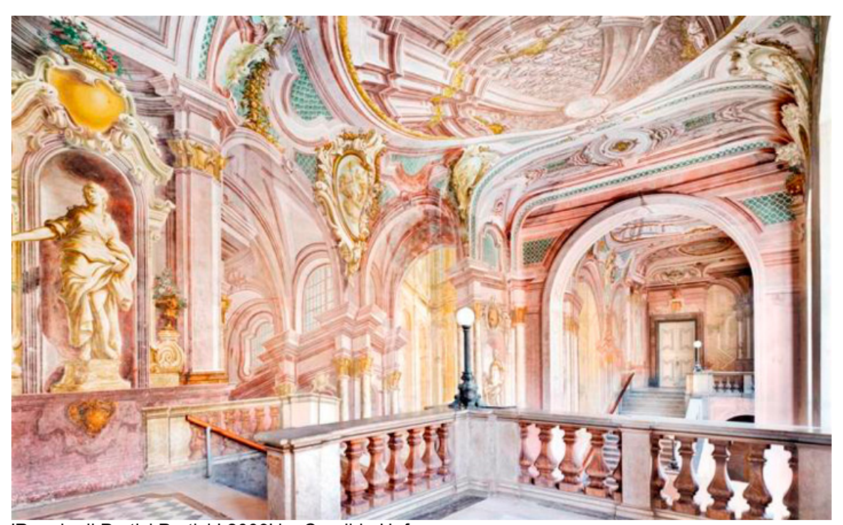
'Reggia di Portici Portici I 2009' by Candida Hofer