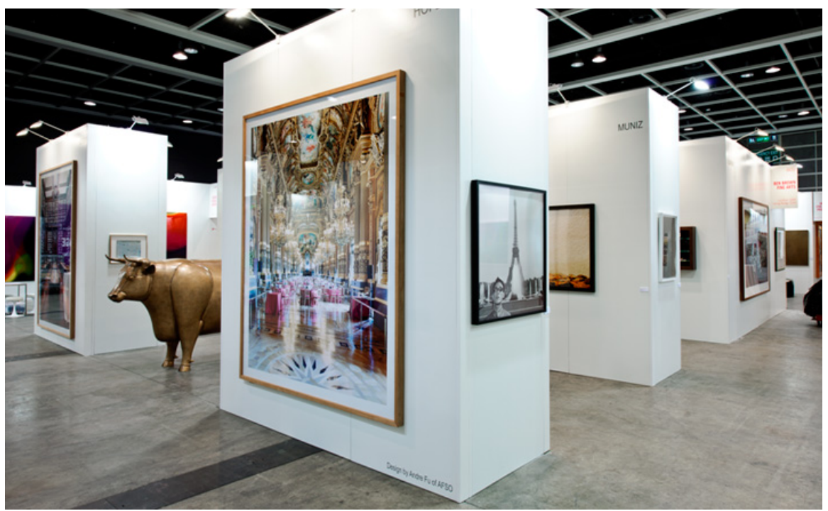
Hofer's work on show at the Ben Brown Fine Arts stand at ArtHK 2010