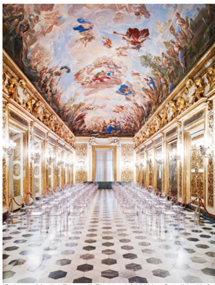
'Palazzo Medici-Riccardi Firenze I 2008' by Candida Hofer