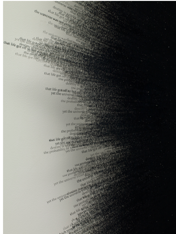
Autonomy (detail; 2016), Idris Khan Courtesy the Artist and Victoria Miro, London; © Idris Khan