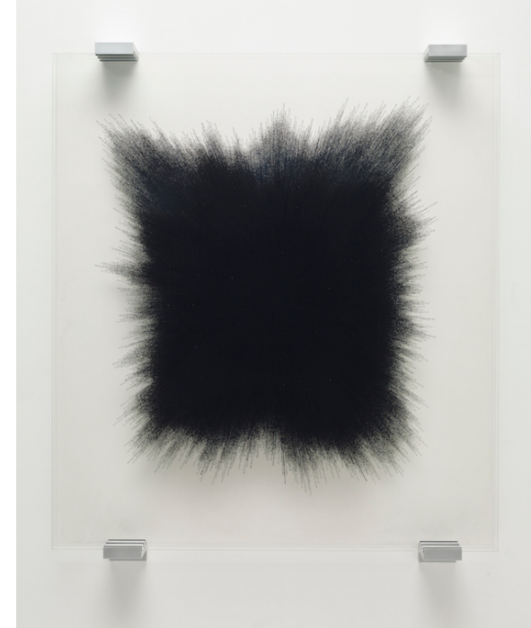
Autonomy (2016), Idris Khan. Courtesy the Artist and Victoria Miro, London; © Idris Khan

A Grey Bucket (2015), Idris Khan. Courtesy the Artist and Victoria Miro, London; © Idris Khan