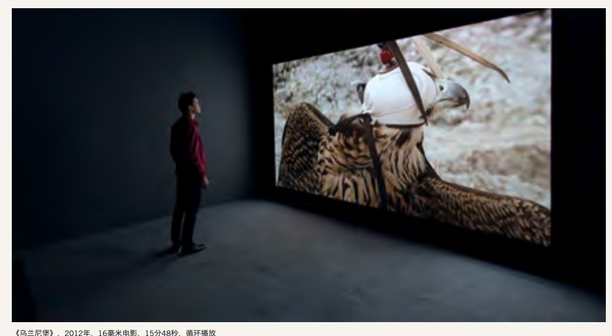
(乌三尼堡), 2012年, 16毫米电影, 15分4处势, 循外播放 展览 "乌兰尼堡" 现场, 巴黎国立网球场现代美术馆(2012年), 蒙特利尔当代美术馆(2013年) Uraniborg, 2012, 16 mm film transferred 15 min 48 sec, looped View of "Uraniborg", Jeu de Paume, Paris, 2012, Musée d'art contemporain, Montréal, 2013

我认为在某个时刻,应当接受整个系统的诞生。(创作)想法的发展是很抽象的认知过程,它不能被全部分析出来。艺术工作(尤其)要避免能够"被分析"。它应该包含一种紧张关