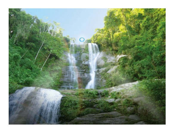
Rendering of Mariko Mori's Ring: One with Nature (2016) presented by the Faou Foundation.