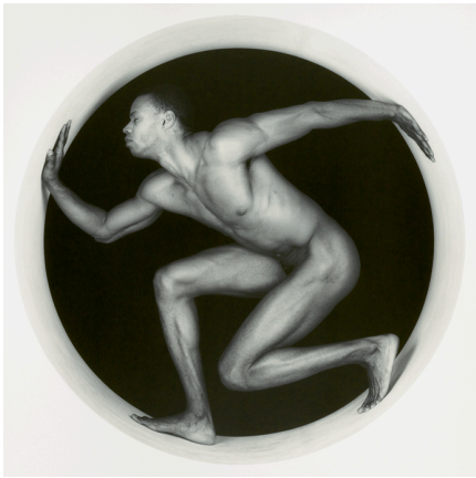
Thomas , 1987/94, gelatin silver print, 19 \frac{1}{4} inches square.