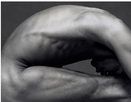
Jason Robert Mapplethorpe, 1983 Gelatin Silver Print. 16" x 20"