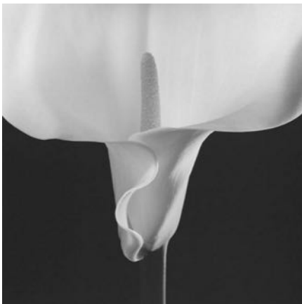
Calla Lily, 1988

Robert Mapplethorpe, American, 1946-1989. Gelatin silver print. Jointly acquired by the J. Paul Getty Trust and the Los Angeles County Museum of Art, with funds provided by the J. Paul Getty Trust and the David Geffen Foundation, 2011.9.26. © Robert Mapplethorpe Foundation.