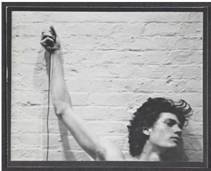
Identical self-portraits of Robert Mapplethorpe with trip cable in hand, 1974

Additionally, during the run of "Robert Mapplethorpe: The Perfect Medium" the Getty Museum's Center for Photographs will also feature the exhibition "The Thrill of the Chase: The Wagstaff Collection of Photographs." Sam Wagstaff's impressive collection of photographs that was acquired by the Getty Museum in 1984 is one of the cores of the collection of the Department of Photographs. This exhibition and accompanying publication of the same name is an opportunity to focus on Wagstaff's collection and his role as one of the most important patrons and collectors of photography.