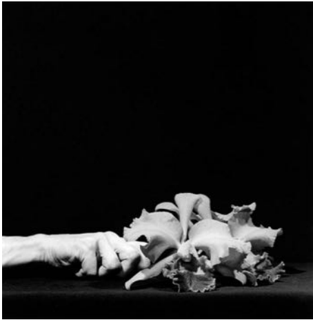
Orchid and Hand Robert Mapplethorpe, 1983 20" x 16", silver gelatin print