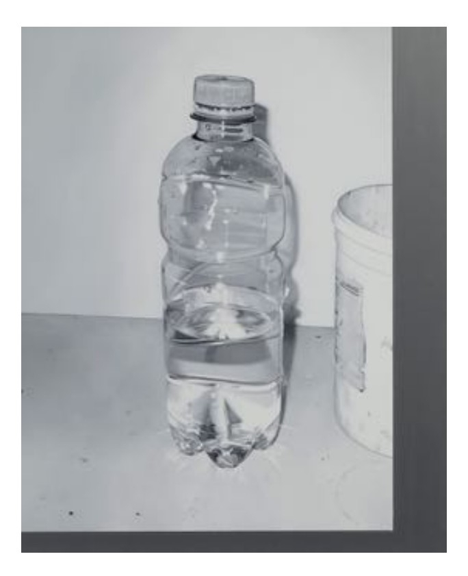
Each image comes tinged with an undercurrent of suspense. Pictured: STILL #4, 2015