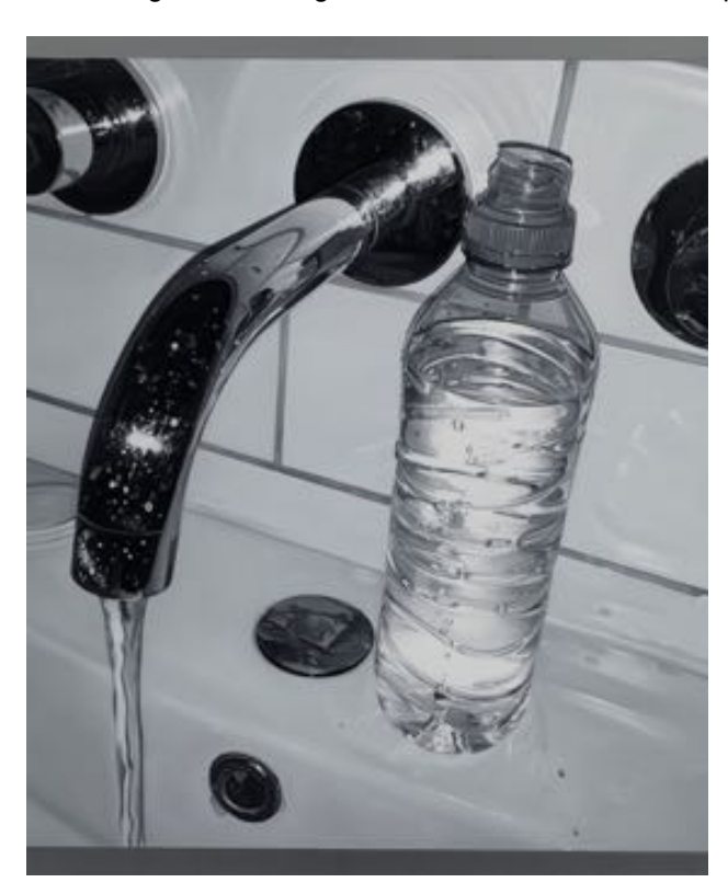
White's work possesses a realism reminiscent of the Flemish masters. Pictured: STILL #2, 2015