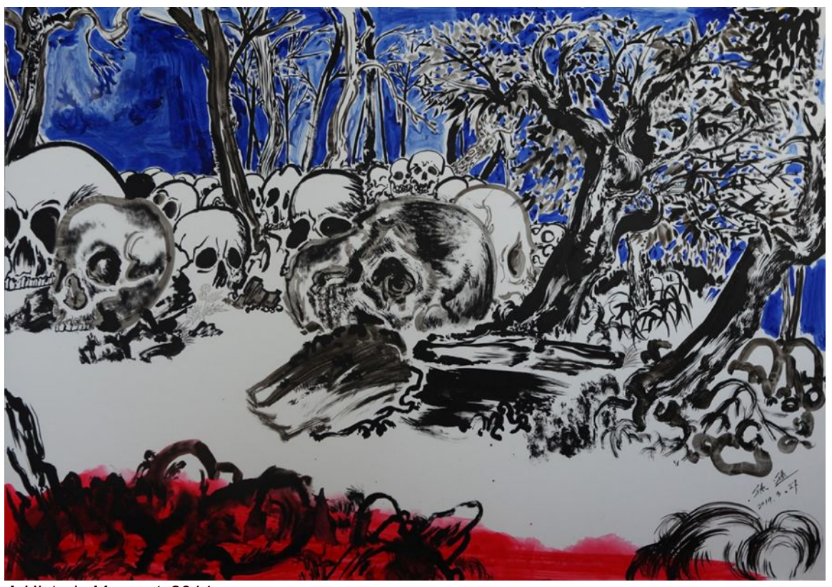
A Historic Moment, 2014 Ink on paper 111.2 x 160.5 cm