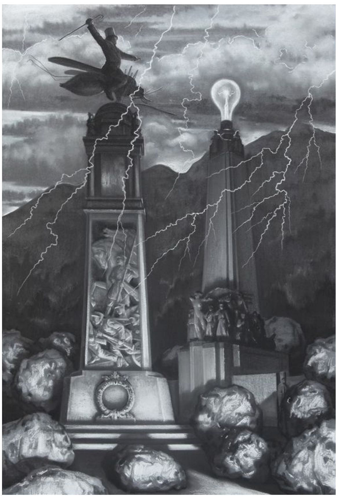
Was Nikola Tesla a Communist?, 2014 Pastel on canvas 120 x 80 x 4 cm