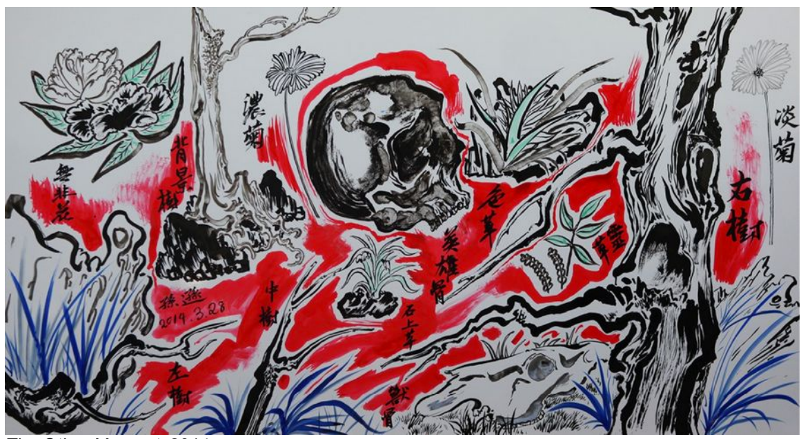
The Other Moment, 2014 Ink on paper 60.3 x 111.8 cm