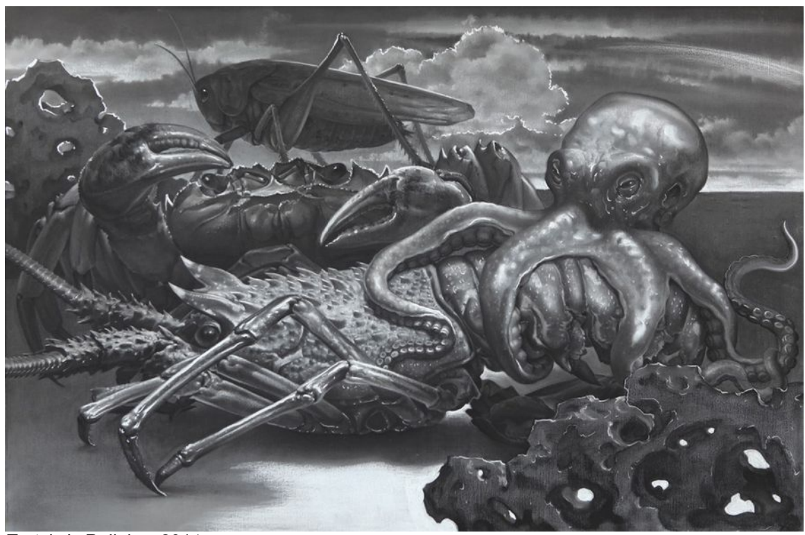
Trotsky's Religion, 2014 Pastel on canvas 80 x 120 x 4 cm