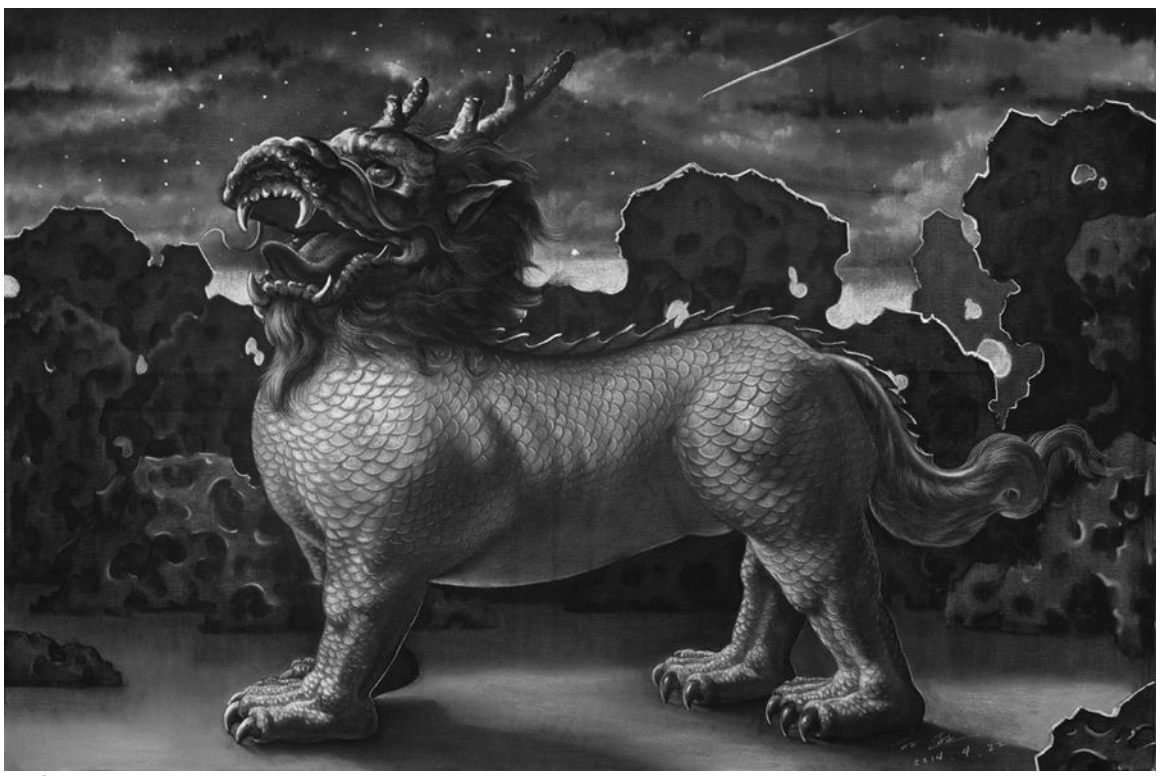
Kafka's Travels, 2014 Pastel on canvas 80 x 120 x 4 cm