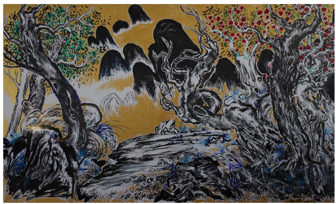
Appreciated Scenery, 2014 Ink on paper 150.1 x 250.2 cm