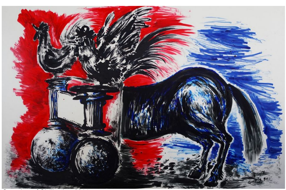
Organism of Civilization, 2014 Ink on paper 150.1 x 232.2 cm