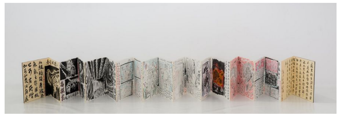
A page from the script for 'What happened in the year of the Dragon?' 2014 Ink on rice paper, 38 pages in total 33 x 33 cm

Anyone can decide. As long as you're willing to think you're welcome to do so. —[O]