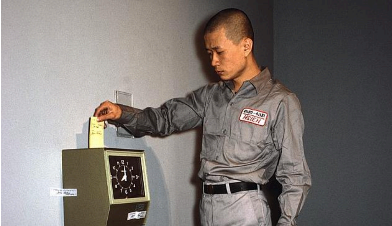
An image from One Year Performance 1980–1981 (Time Clock).

WHEN Taiwan-born New York-based artist Tehching Hsieh was about 18, he encountered Albert Camus's essay The Myth of Sisyphus , and something stuck with him. "It was rooted in my head," he says. "I was aware of the absurdity of Sisyphus's burden. And his happiness."