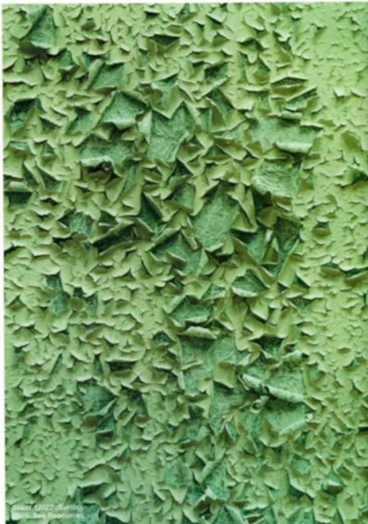
Stair, 12/22 (Berlin) © 2009 Sean Kelly

As the 1990s wore on and the construction cranes and wrecking balls became a more banal sight, >