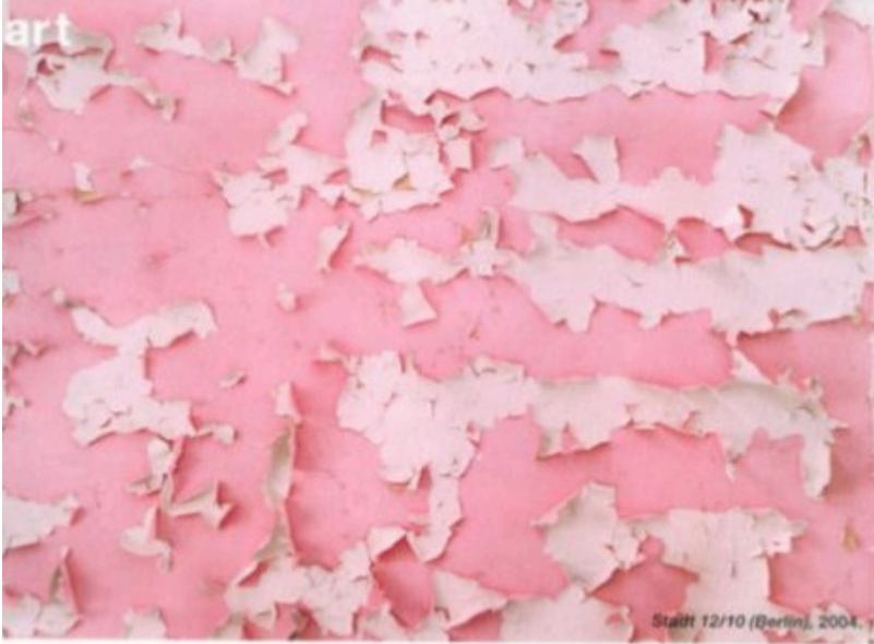
Stadt 12/10 (Berlin), 2004.