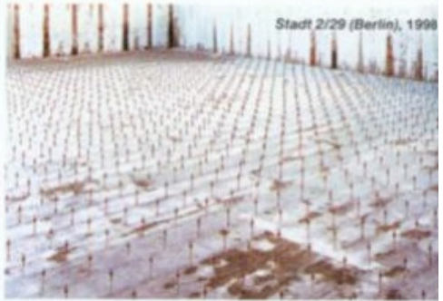
Stadt 2/29 (Berlin), 1998

"Berlin has 60 billion euros of debt—it's a very serious situation," he says, ticking off a laundry list of the city's cultural and real estate crises, none of which, in his opinion, are being addressed properly. "But I didn't want to photograph poor people or homeless people, or just go cataloguing ruins and empty spaces. I wanted to find a different way to talk about it. And why not a beautiful way?" ■