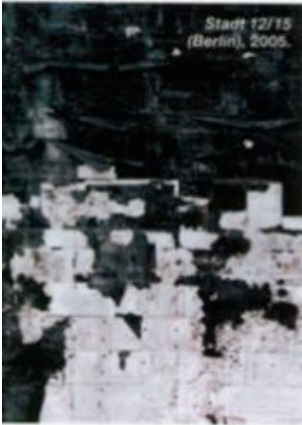
Stadt 12/15 (Berlin), 2005.