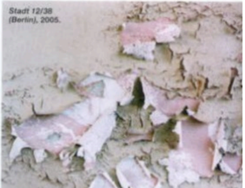
Stadt 12/38 (Berlin), 2005.