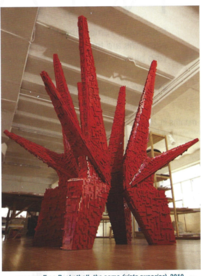
OPPOSITE Free Basketball—the same (vista superior), 2010, a watercolor study for a sculptural installation created for the Indianapolis Museum of Art's Art & Nature Park (top). La Montaña Rusa, 2008, a surrealistic piece that doubles as a roller-coaster and a bed (bottom). ABOVE Kosmaj Toy, 2012, wittily replicating a utopian Soviet building, is composed of Legos.

Observes Berry, "As specific as their work is to the Cuban context, it also transcends that context." He explains, "It belongs to the wider recent history of drawing, for instance. Or to the recent history of playing with translation and mistranslation. Or with art that demands interaction with its public."